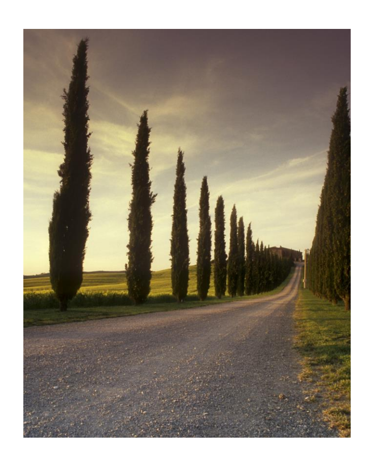
Consultation on the EU Just Transition Fund and the development of a draft Territorial Just Transition Plan