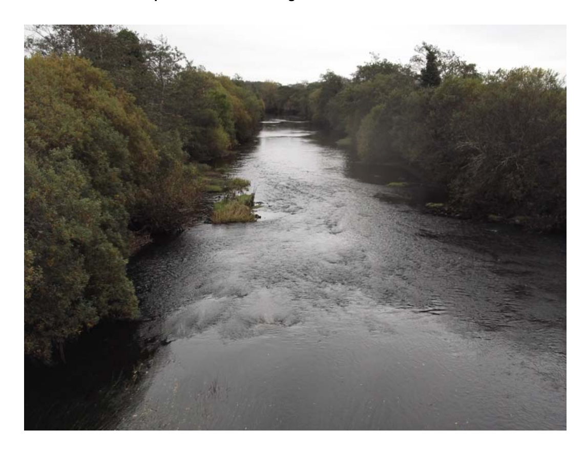
Plate 3.4.5 View of River Deel looking upstream from N59 Bridge at Knockadanagan