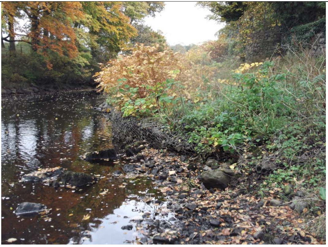
Plate 3.4.4 Japanese Knotweed along River Deel behind Crossmolina Town