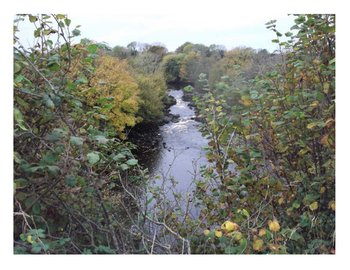
Plate 3.4.1 View of the River Deel downstream of Ballycarroon Ford

It should be noted that in various locations within the study area, the invasive species Japanese Knotweed ( Fallopia japonica ) was encountered along the riparian corridor. Rhododendron ( Rhododendron ponticum ) and Laurel ( Prunus lauroceratus ) were noted in stands of trees within the study area but were not widespread throughout the area and were not noted within the riparian corridor.