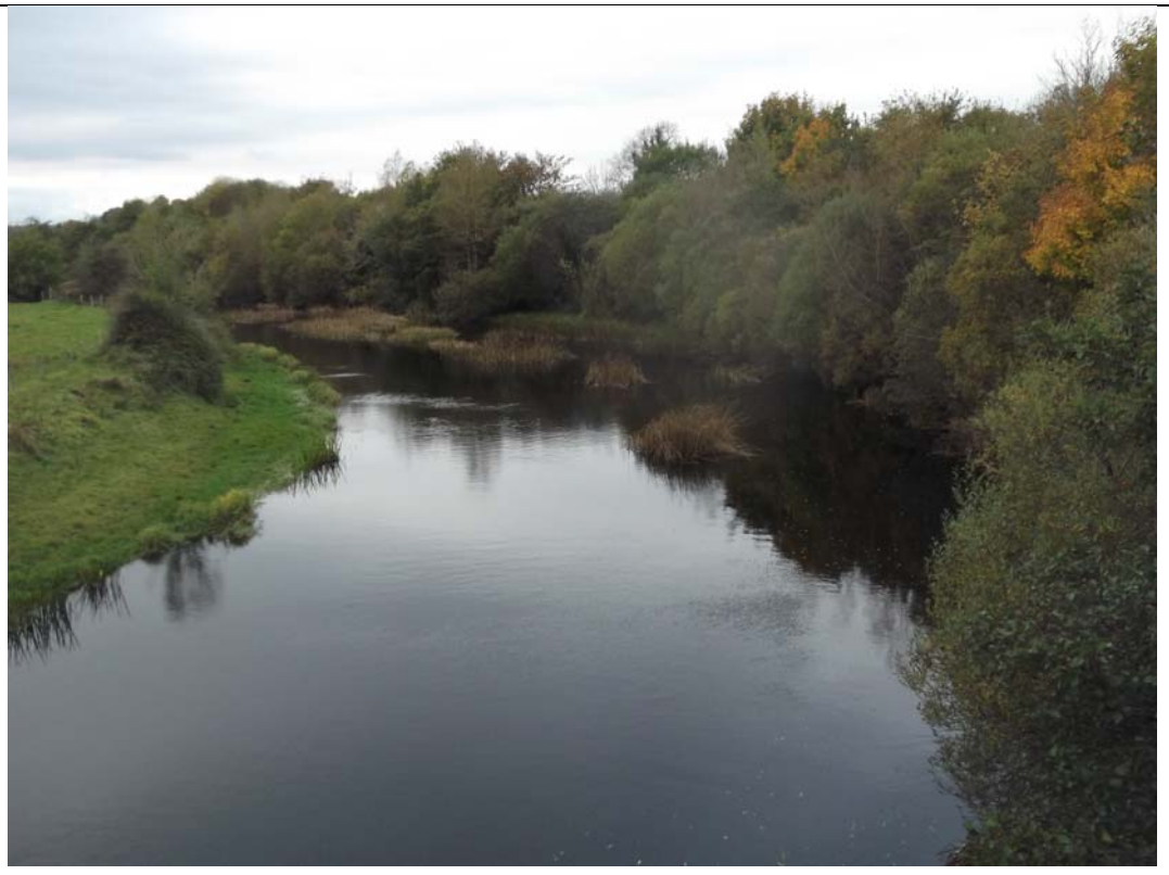
Plate 3.4.6 View of River Deel with stands of Common Club-rush near Deelcastle