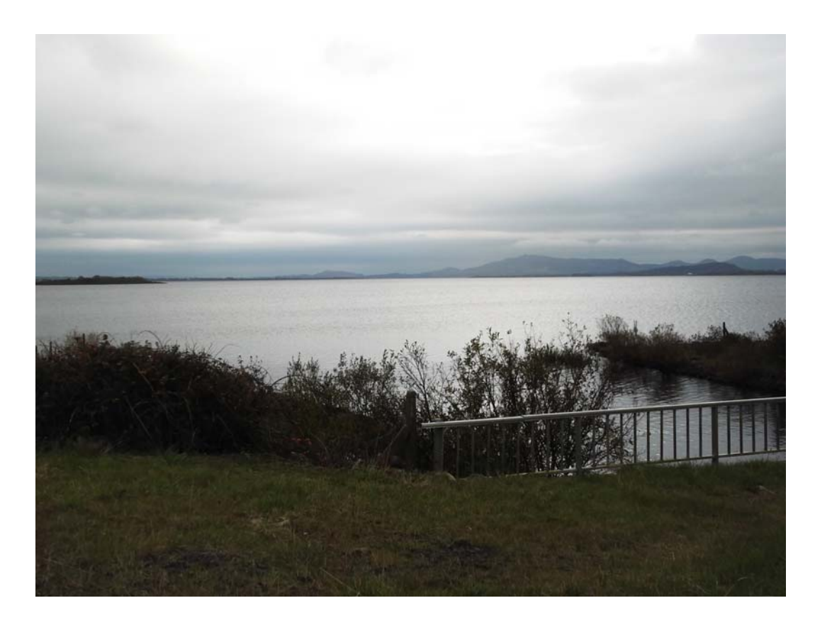
Plate 3.4.7 View of Lough Conn from Wherrew close to the mouth of the River Deel