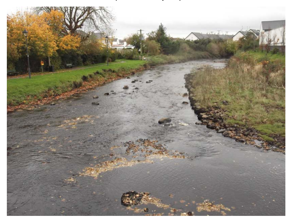
Plate 3.4.3 View of the River Deel downstream of the bridge in Crossmolina Town