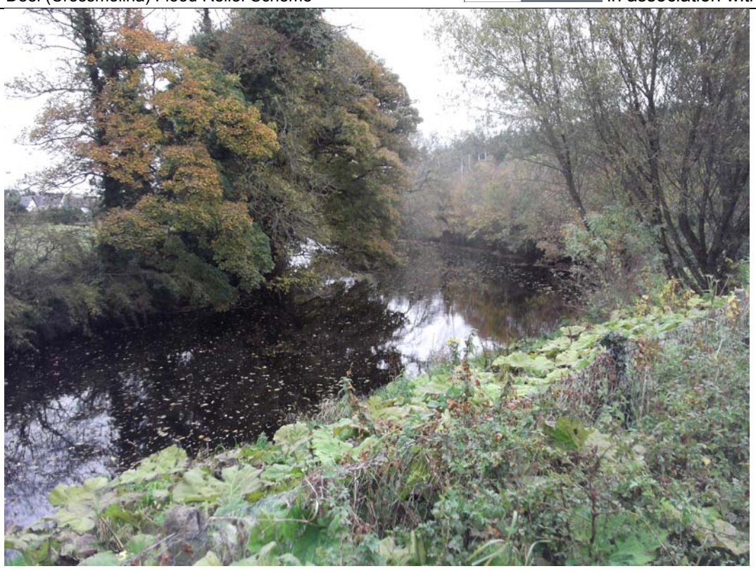
Plate 3.4.2 View of River Deel riparian corridor just upstream of Crossmolina Town