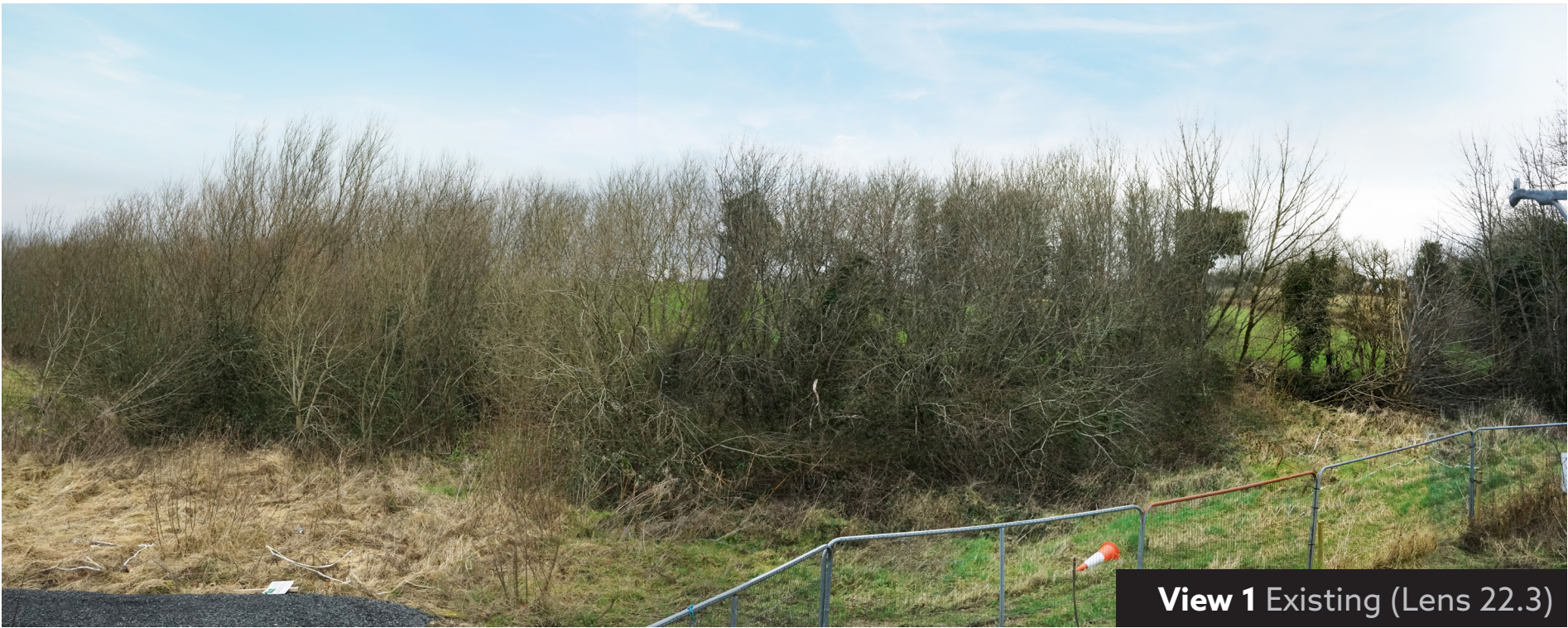
View 1 Existing (Lens 22.3)