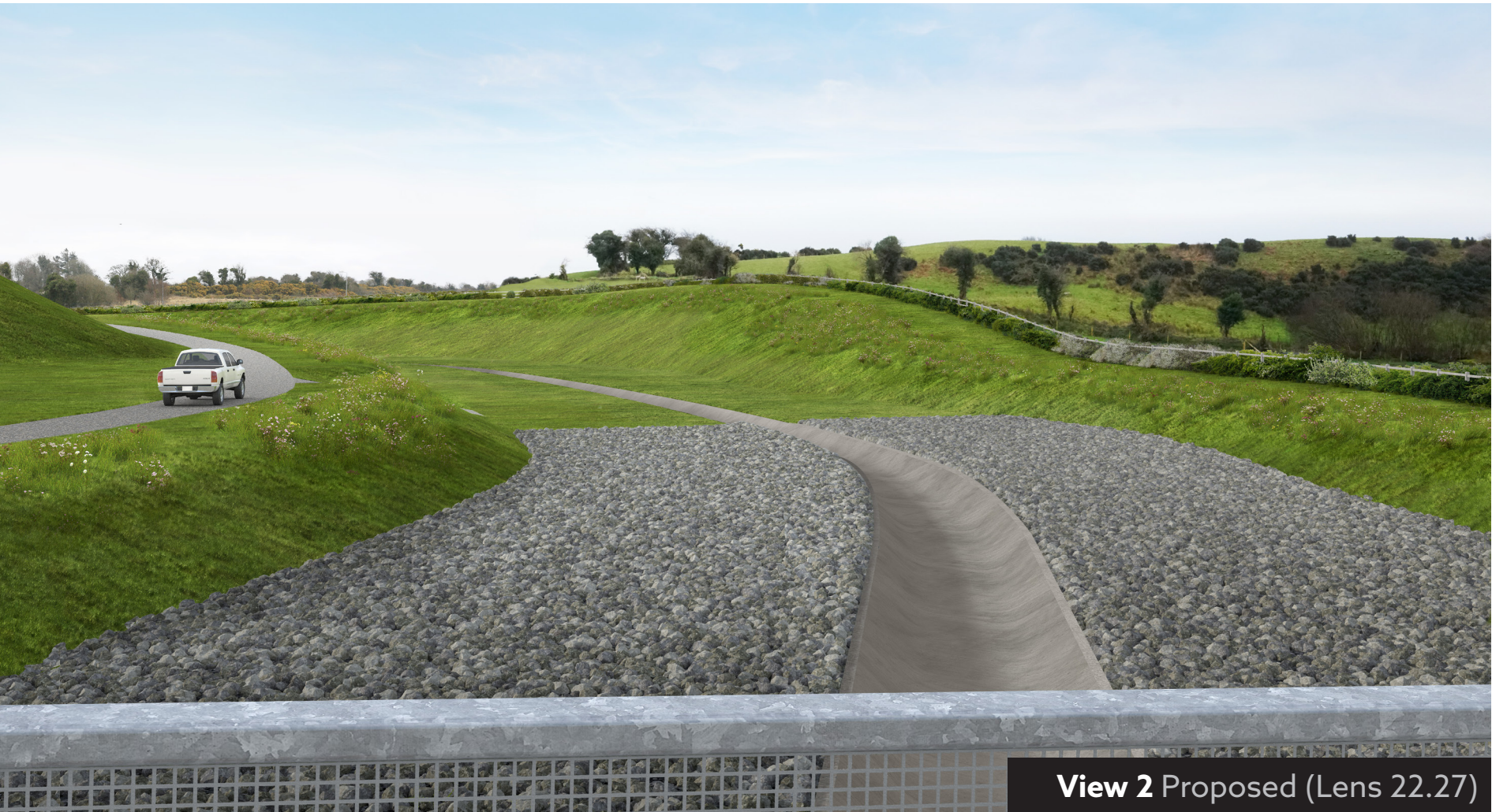
View 2 Proposed (Lens 22.27)