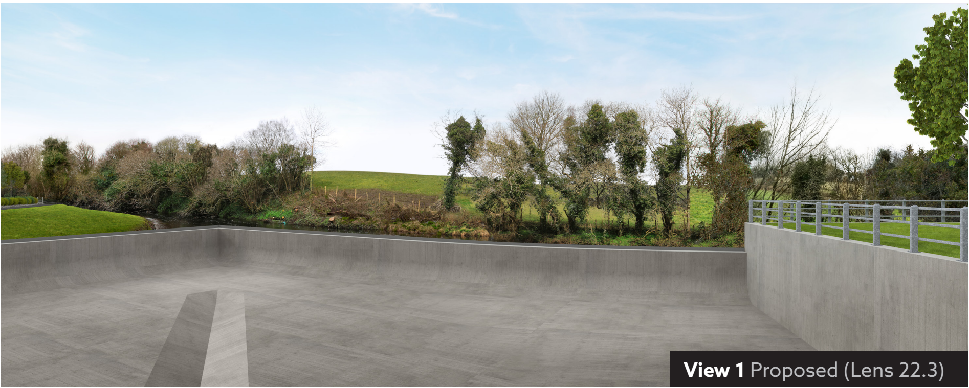
View 1 Proposed (Lens 22.3)