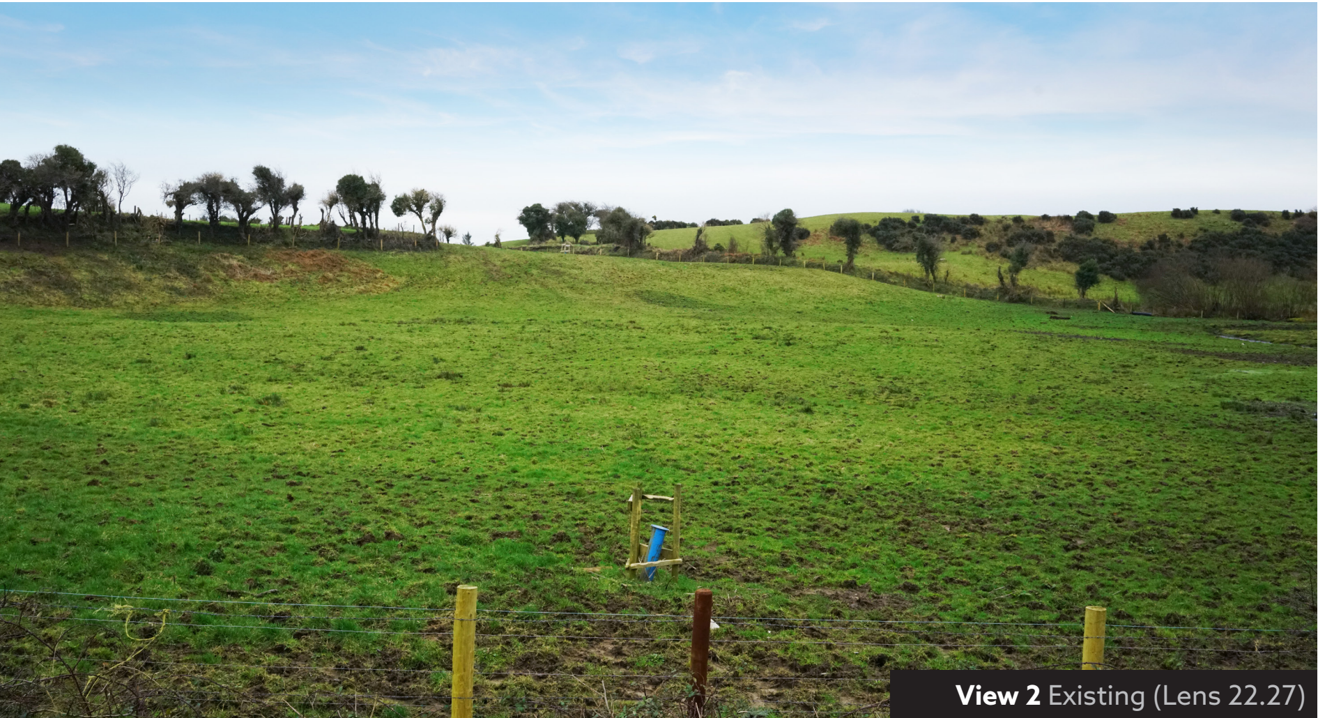
View 2 Existing (Lens 22.27)