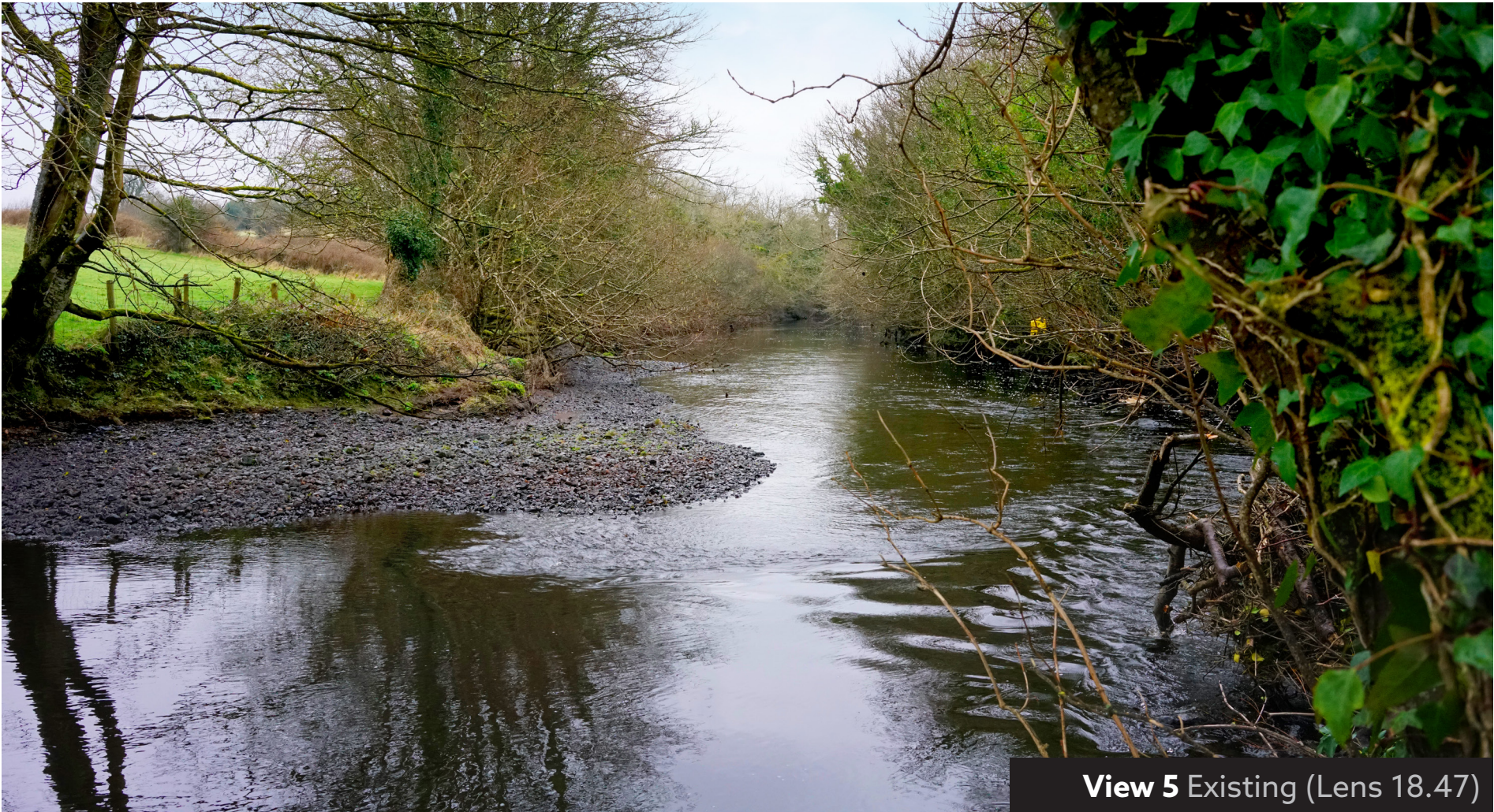
View 5 Existing (Lens 18.47)