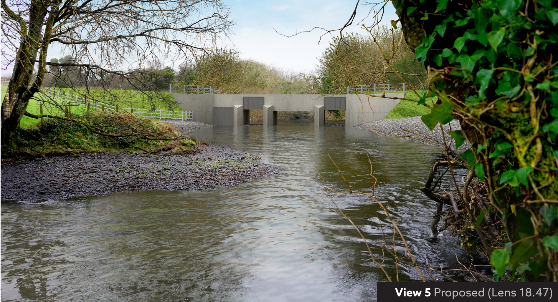
View 5 Proposed (Lens 18.47)