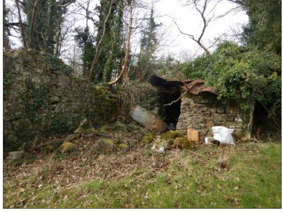
Plate 10.38 Northernmost structure of north/south range in mill complex, looking west