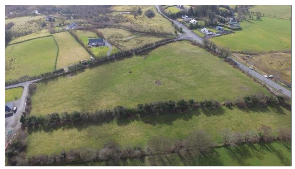
Plate 10.26 Field 9 at centre of frame, looking south