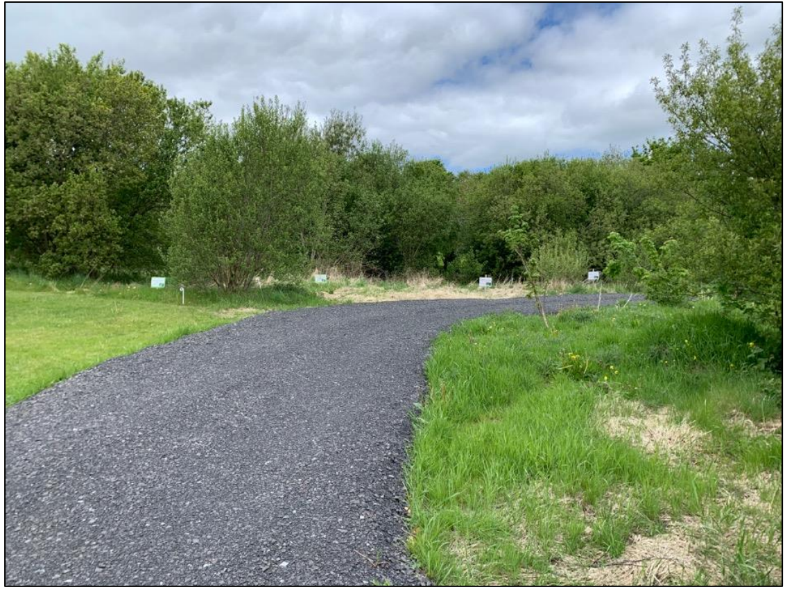
Plate 10.56 View towards proposed weir from adjoining garden (F1), looking northwest