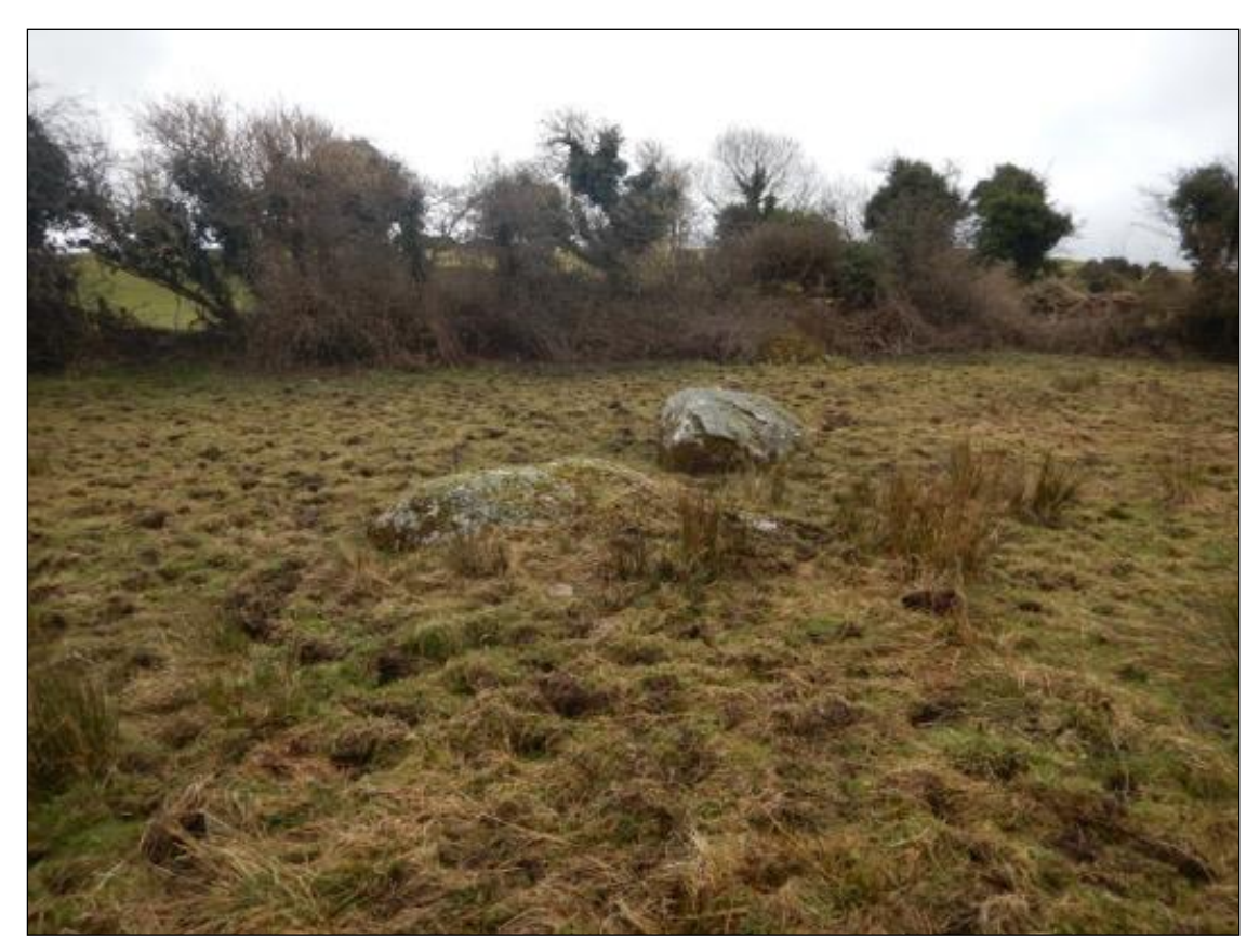
Plate 10.11 Boulders within east end of field 4, looking southeast