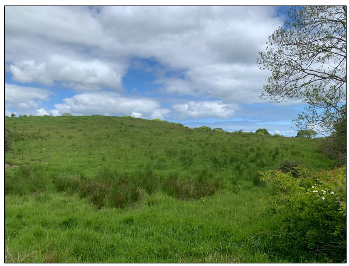
Plate 10.27 Field 9, looking northeast (May 2020)