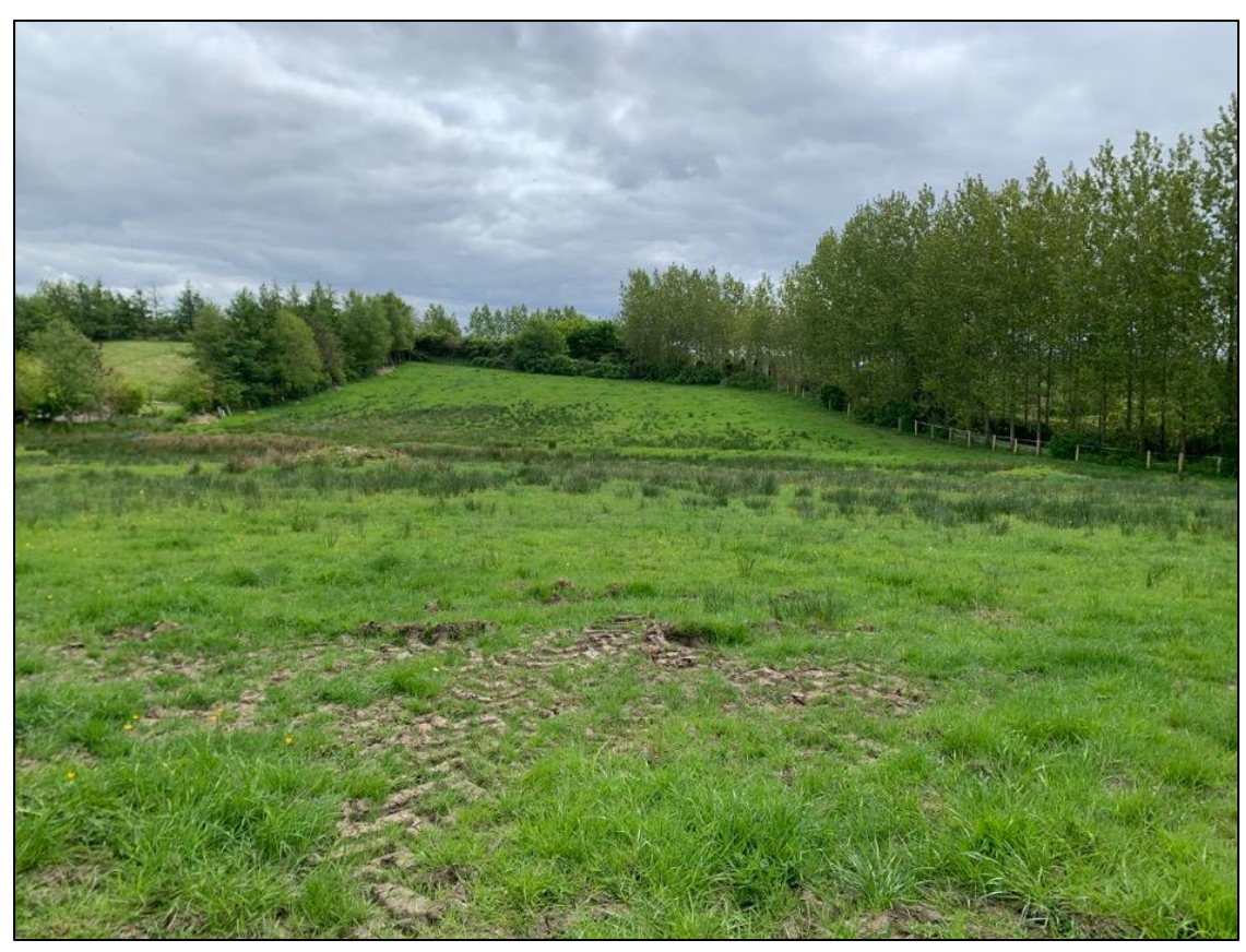
Plate 10.30 Field 10, looking south (May 2020)