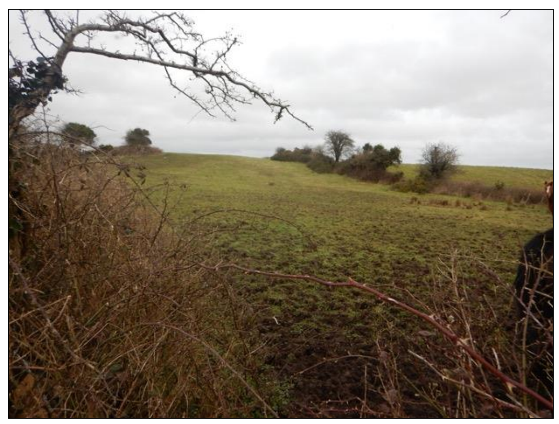
Plate 10.16 Southern portion of field 5, looking northeast