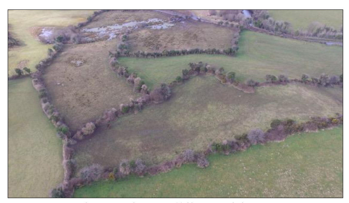
Plate 10.15 Southern portion of field 5 at centre, looking west