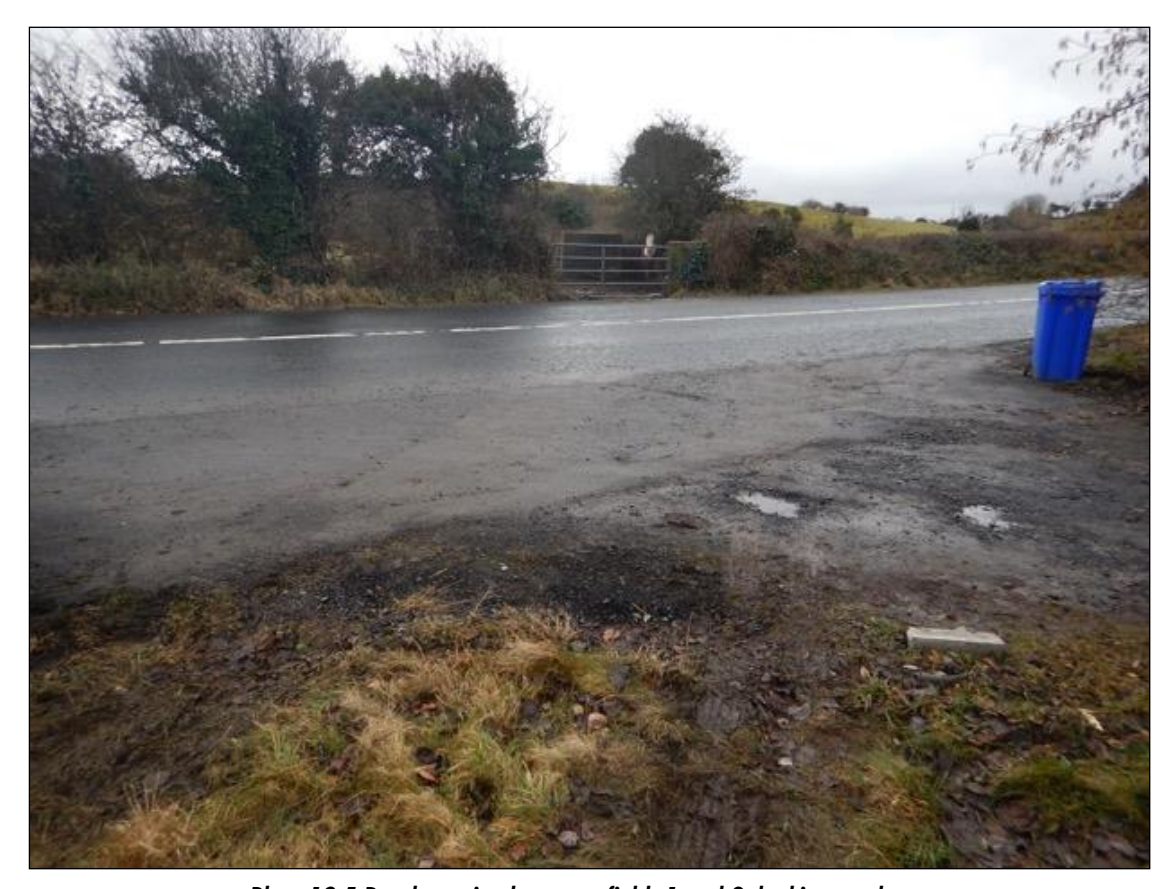
Plate 10.5 Road crossing between fields 1 and 2, looking southeast