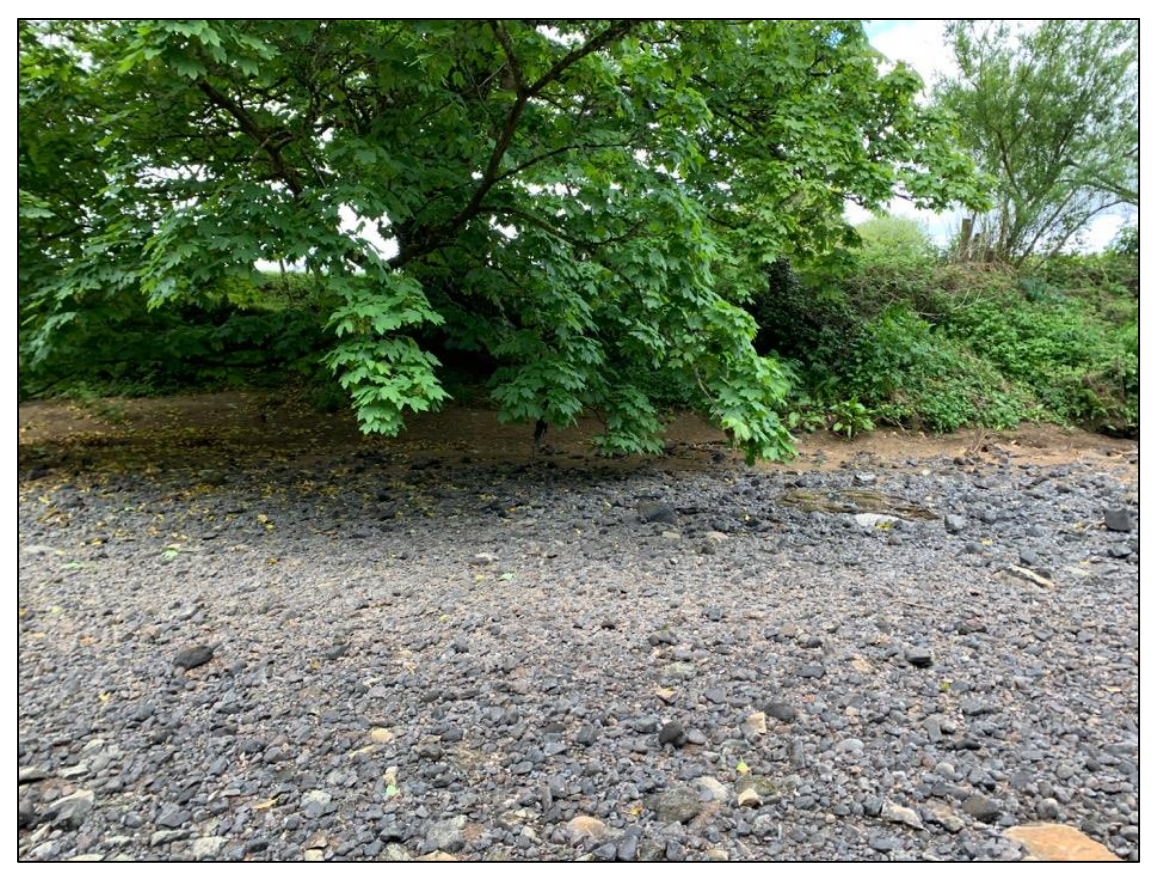
Plate 10.53 Western bank of river at site of proposed river flow control system, looking west