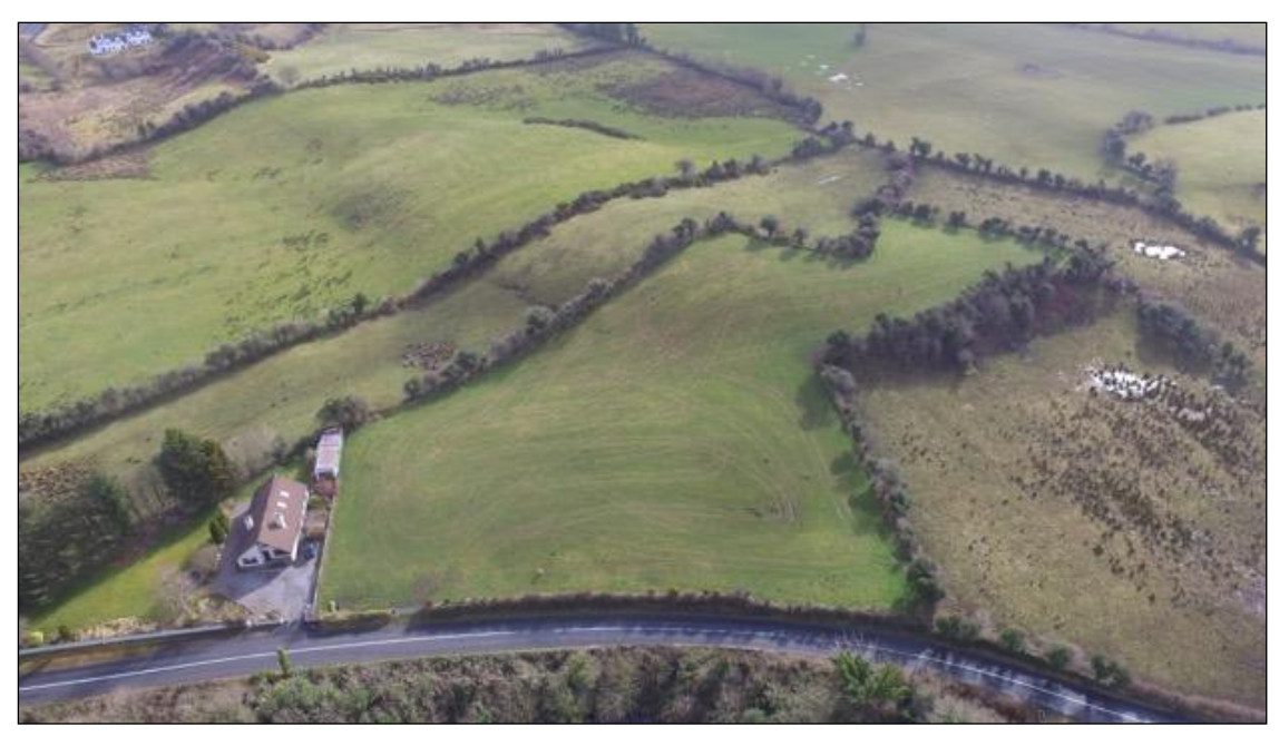
Plate 10.8 Field 3 at centre, looking southeast, only south end of this field will be impacted by proposed works