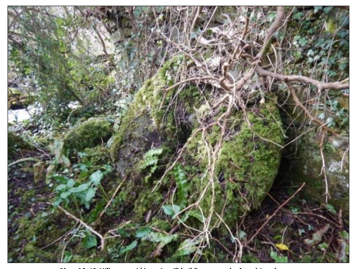
Plate 10.43 Mill stone within main mill building, at south of north/south range