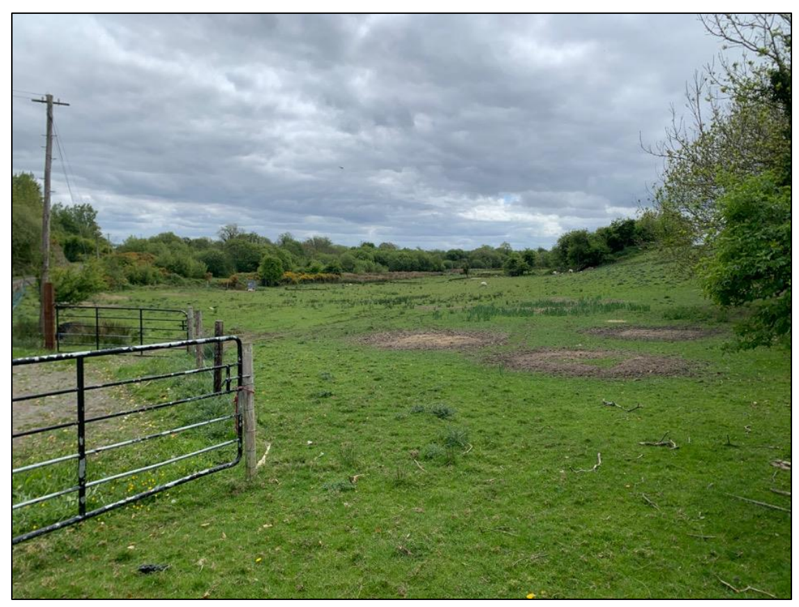
Plate 10.32 Field 11, looking south (May 2020)