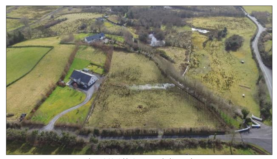
Plate 10.29 Field 10 at centre, looking south