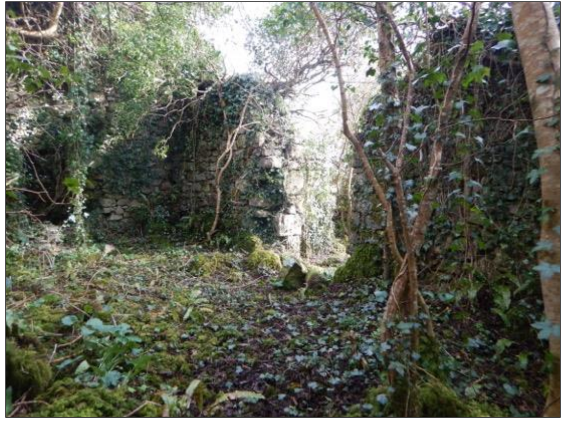
Plate 10.44 interior of southern portion of southern building in north/south range, looking northeast