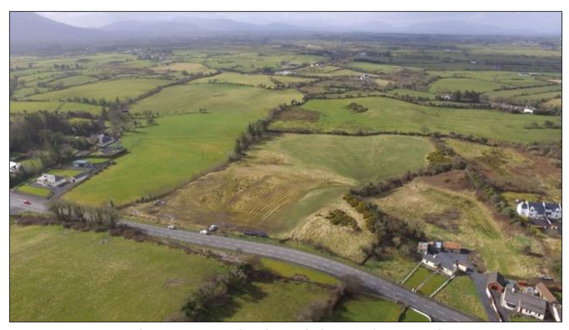
Plate 10.49 Proposed works area looking west from east end