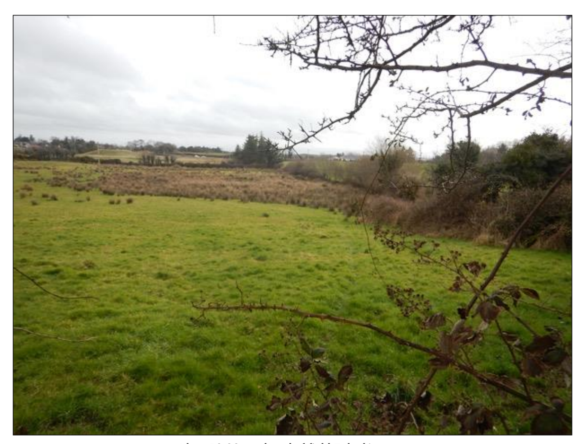
Plate 10.22 south end of field 7, looking east