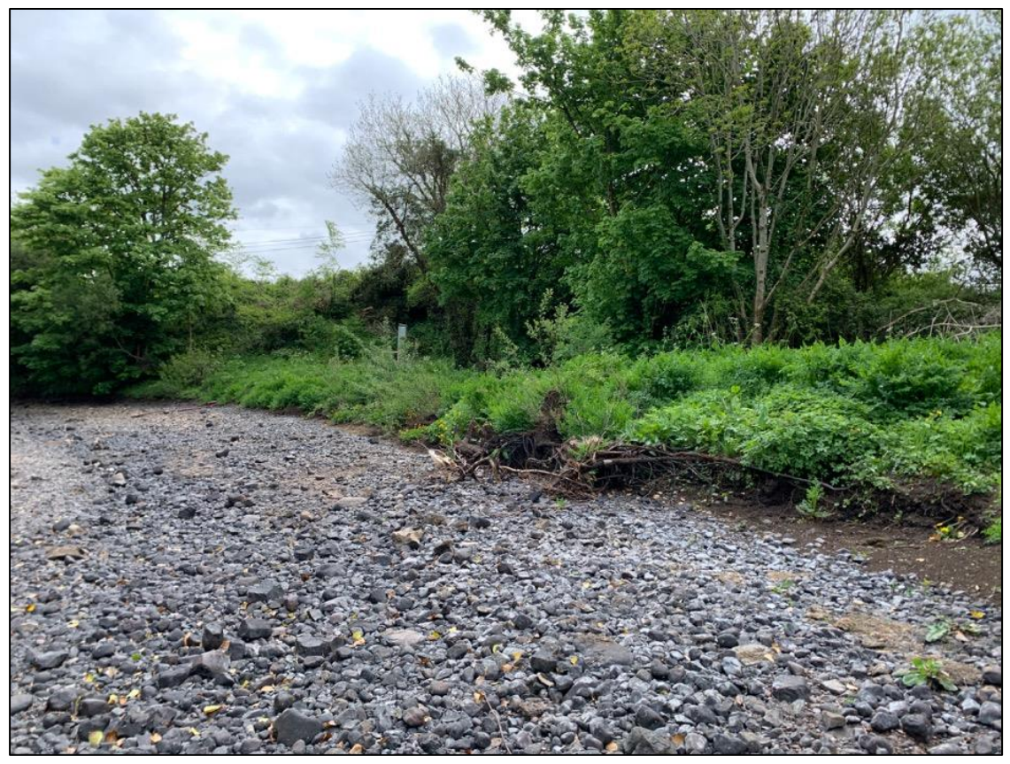
Plate 10.55 View of bank at the site of the proposed weir, looking east