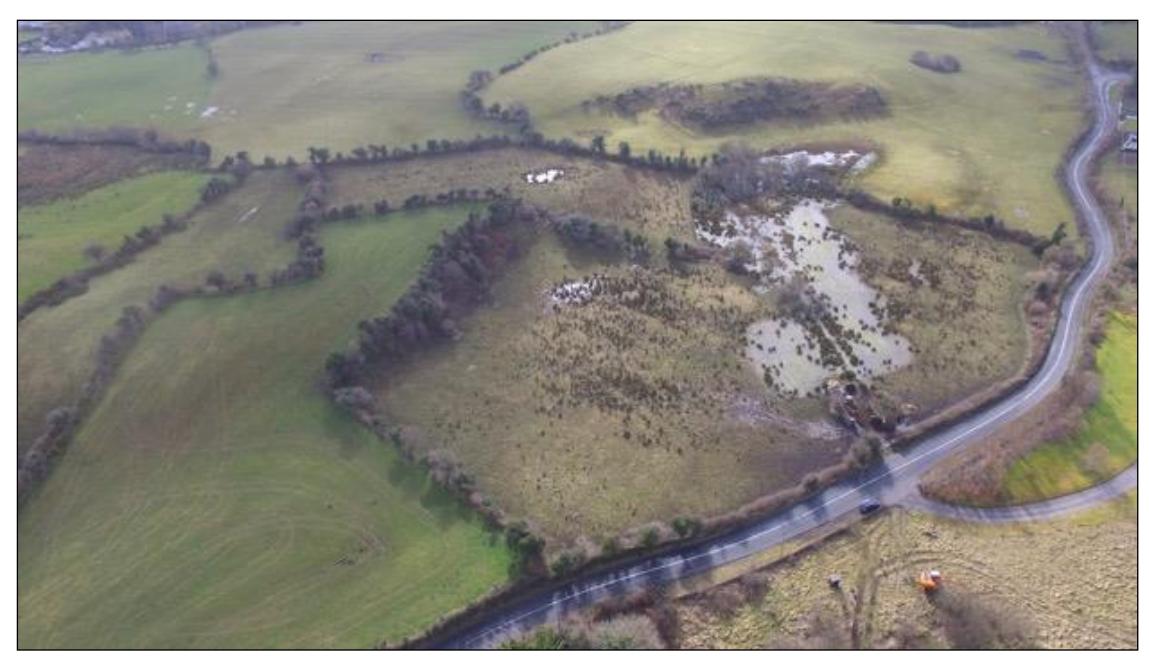
Plate 10.6 Field 2, at centre, looking southeast