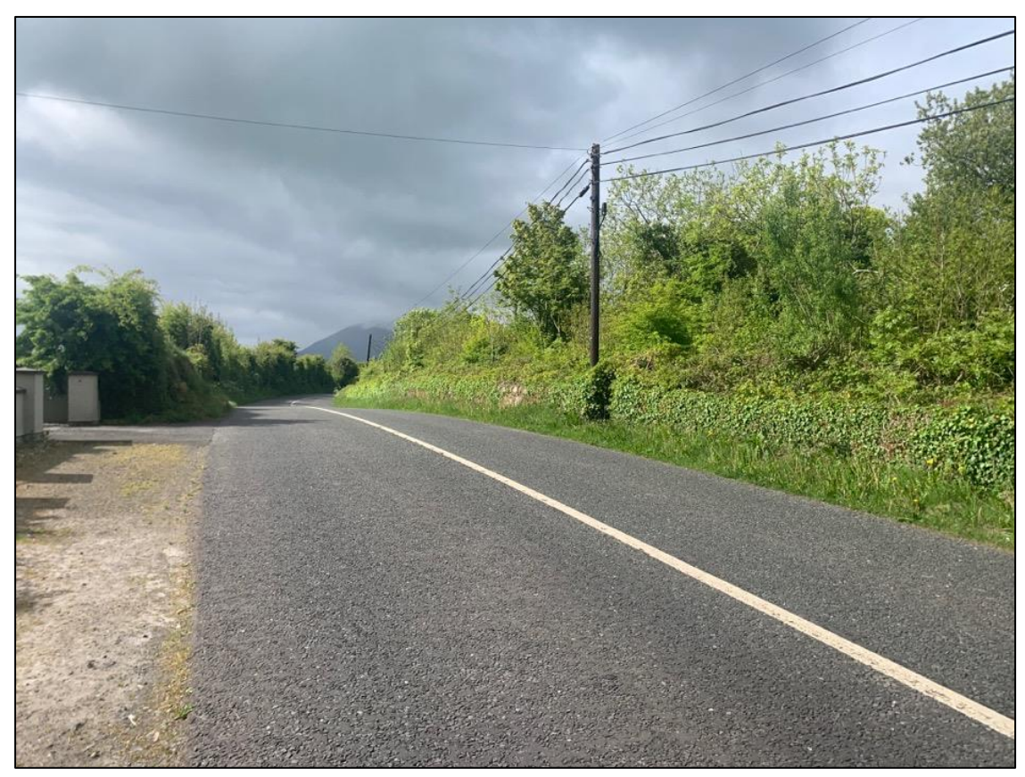
Plate 10.50 Road to the east of the proposed river flow control system, looking south (river to right of frame)