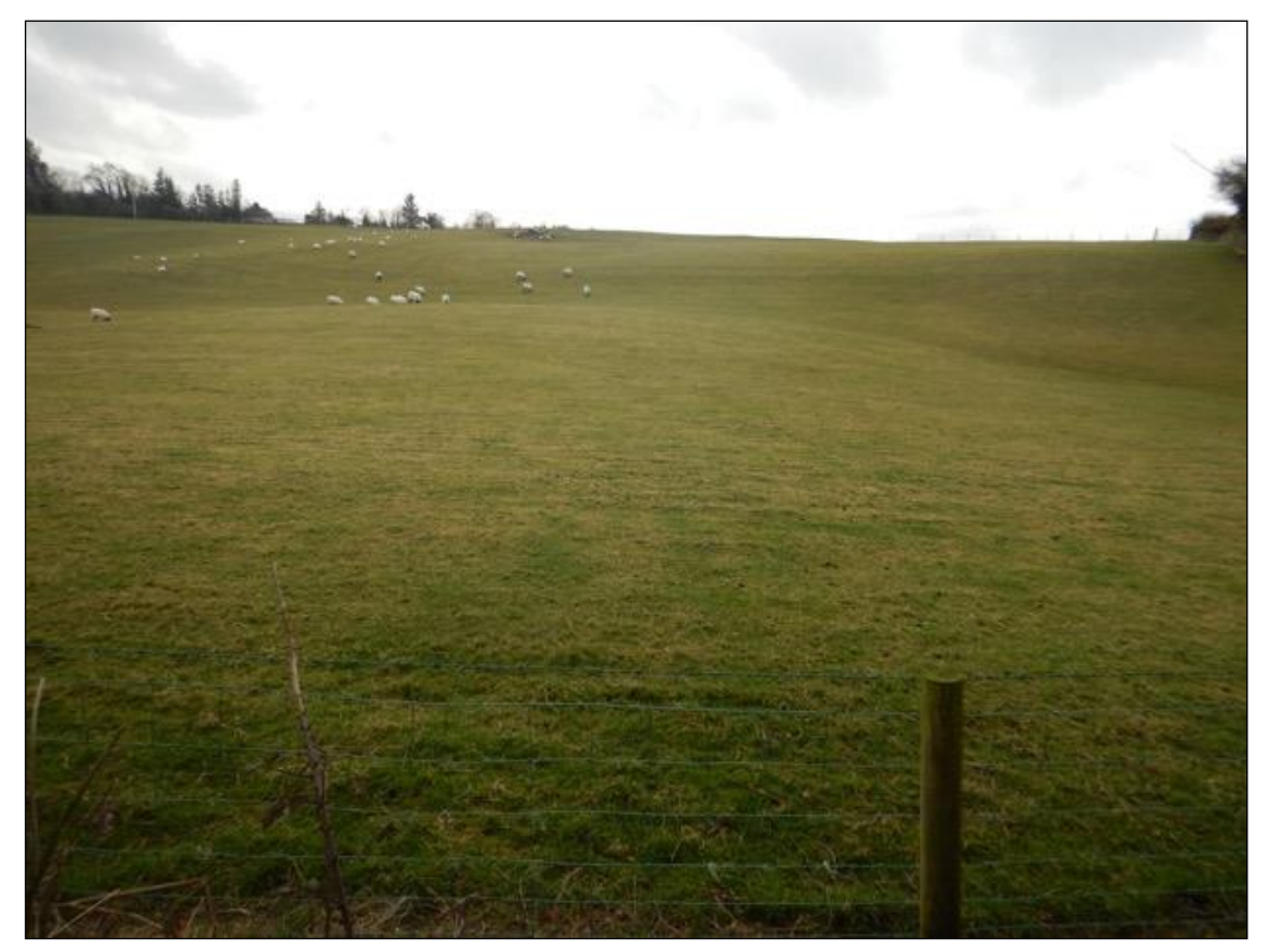
Plate 10.18 Field 6, looking south