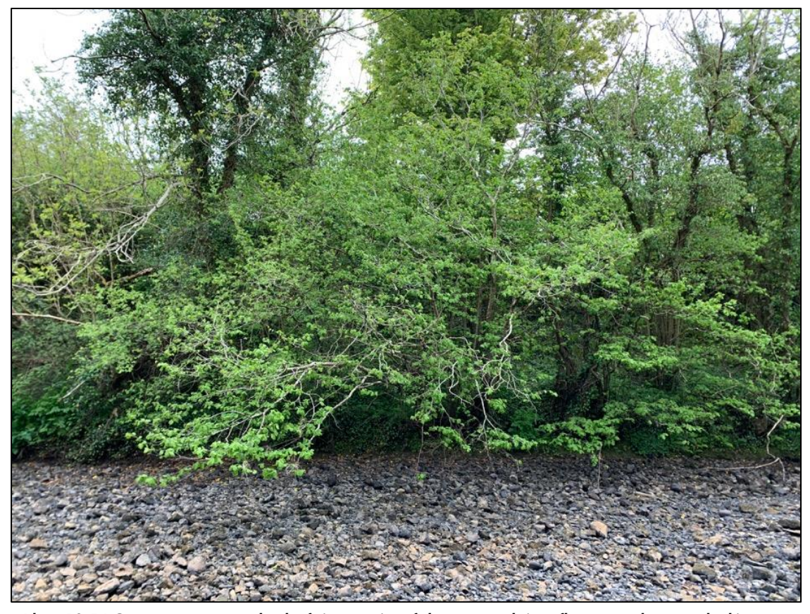
Plate 10.54 Overgrown eastern bank of river at site of the proposed river flow control system, looking east