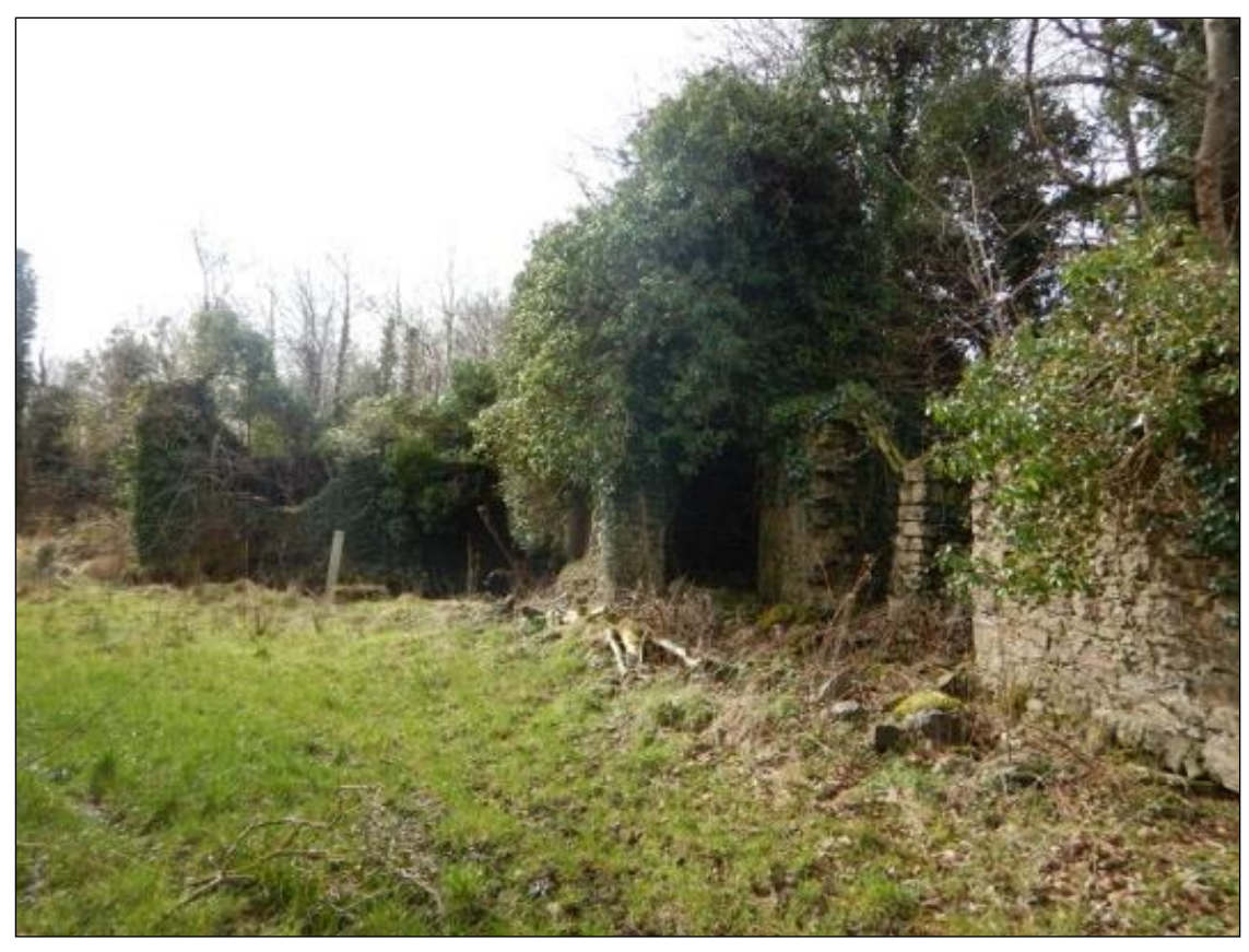
Plate 10.40 Free standing building to the east of the main mill at left, north/south range to right, looking south