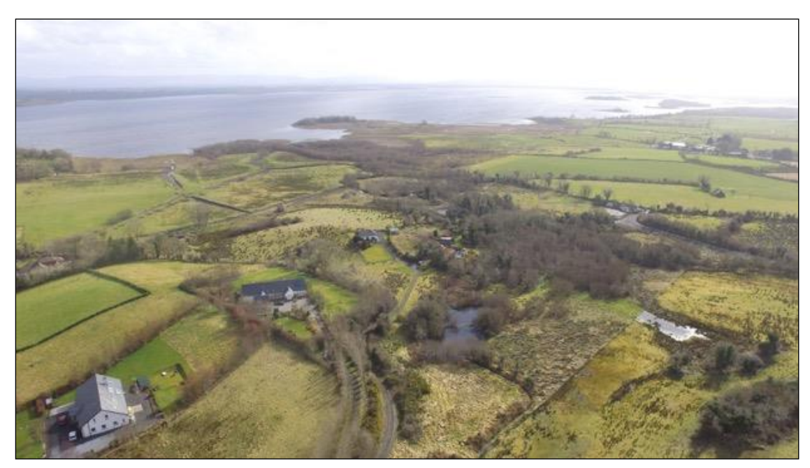
Plate 10.33 Washlands to the east of proposed diversion channel, looking southeast