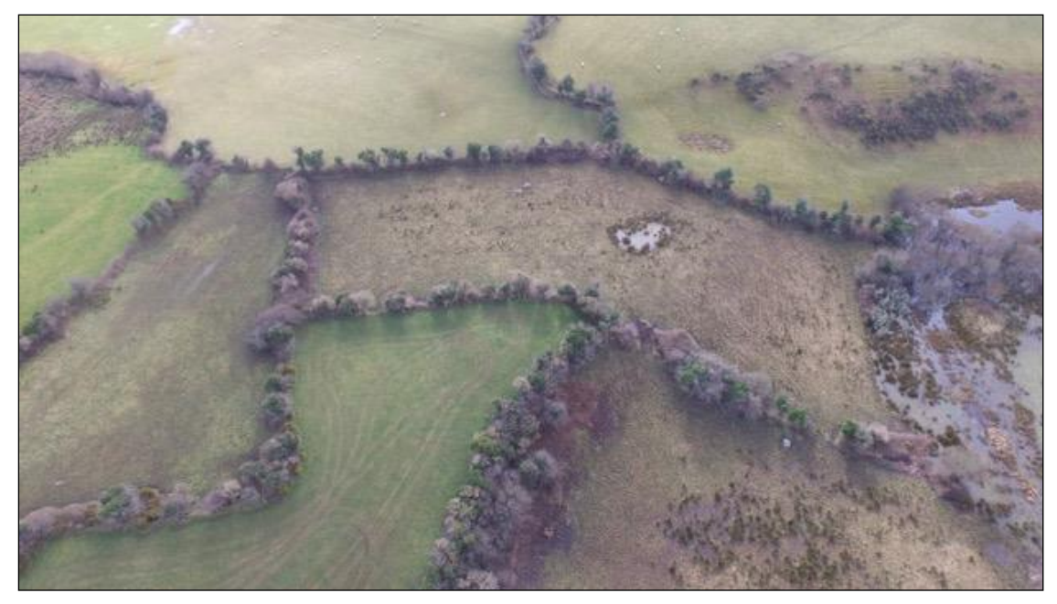
Plate 10.10 East end of field 4 (to be impacted by proposed works), at centre, looking south