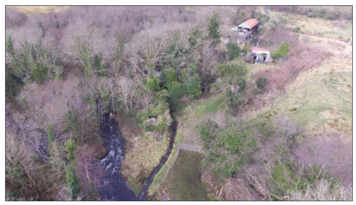
Plate 10.48 Mill race and stream at south of mill complex (overgrown at centre of frame), looking northwest