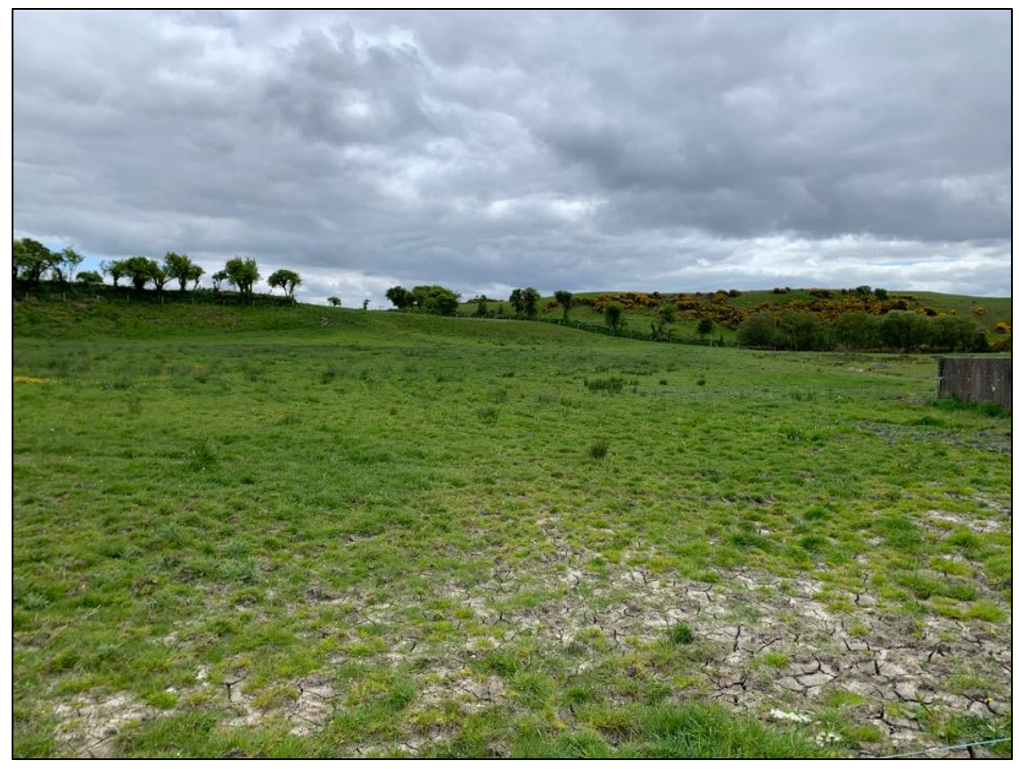
Plate 10.7 South end of field 2 on line of proposed channel, looking east (May 2020)