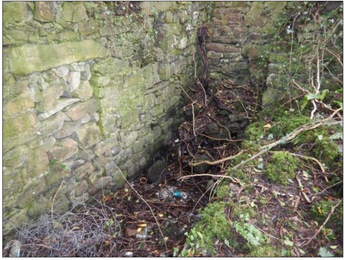
Plate 10.42 Water filled channel within central building in north/south range, looking southwest