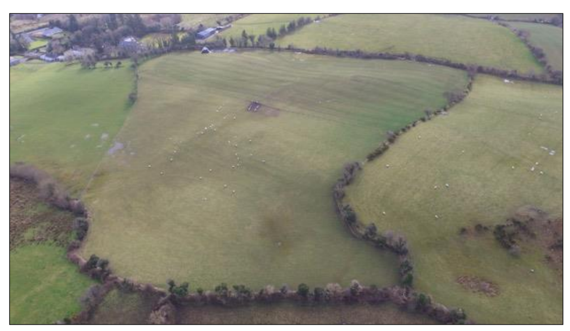
Plate 10.17 Field 6 at centre, looking south, townland boundary at bottom of frame