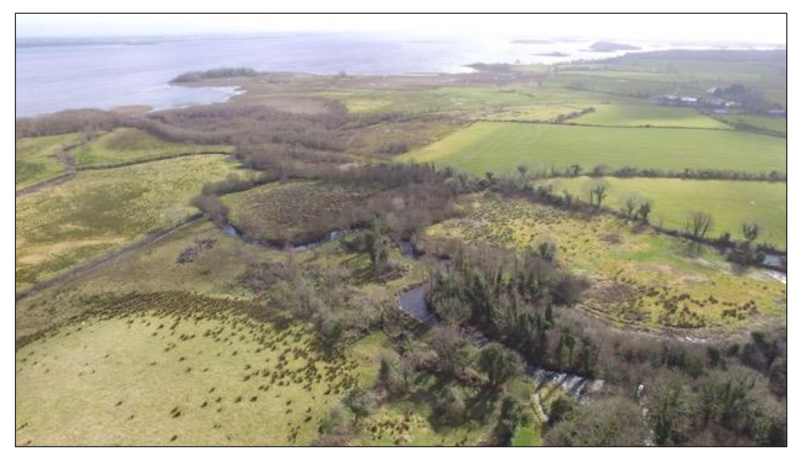
Plate 10.34 East end of washlands, looking southeast