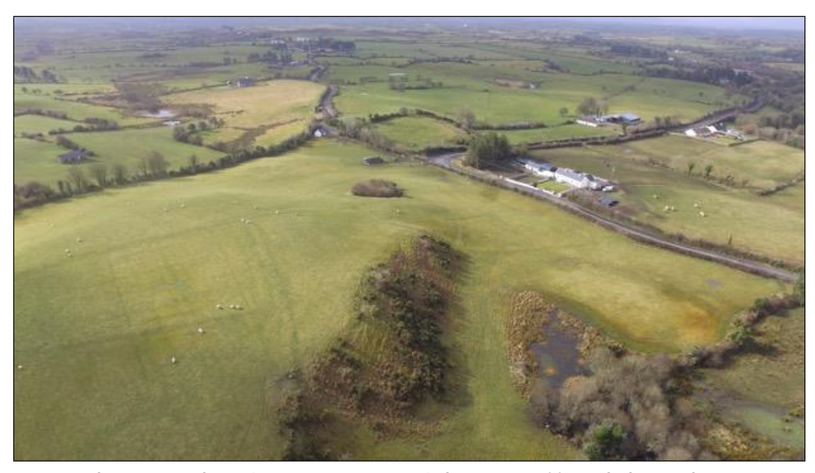
Plate 10.19 Enclosure (CHS 1; MA038-159----) above centre of frame, looking southwest