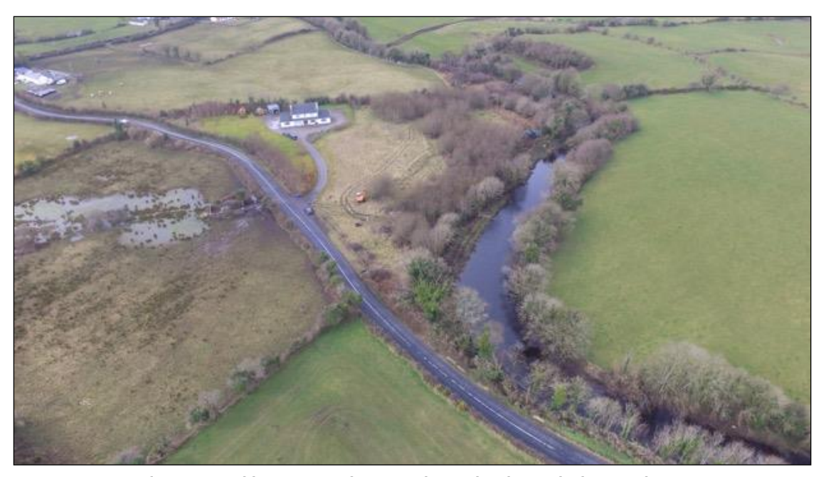
Plate 10.3 Field 1, at centre between the road and river, looking southwest