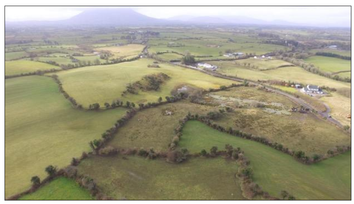
Plate 10.20 Enclosure (MA038-159----) above centre of frame, field 6 to left of frame, field 1 to right of frame and townland boundary crossing from bottom left corner towards centre of frame