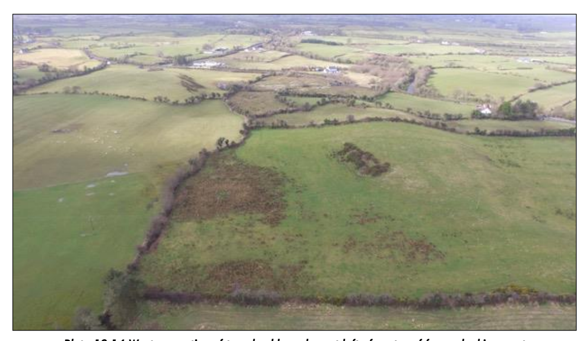
Plate 10.14 Western portion of townland boundary at left of centre of frame, looking west