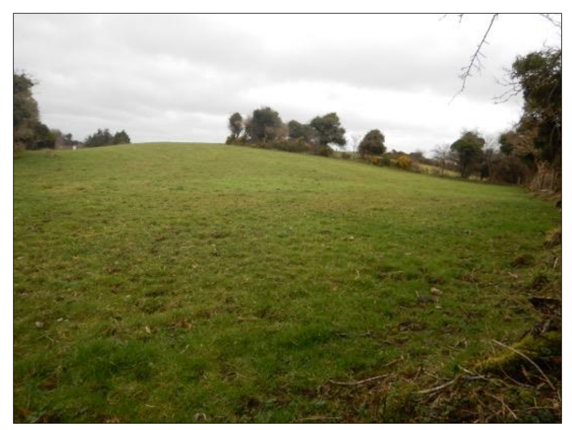
Plate 10.9 South end of field 3, looking northeast