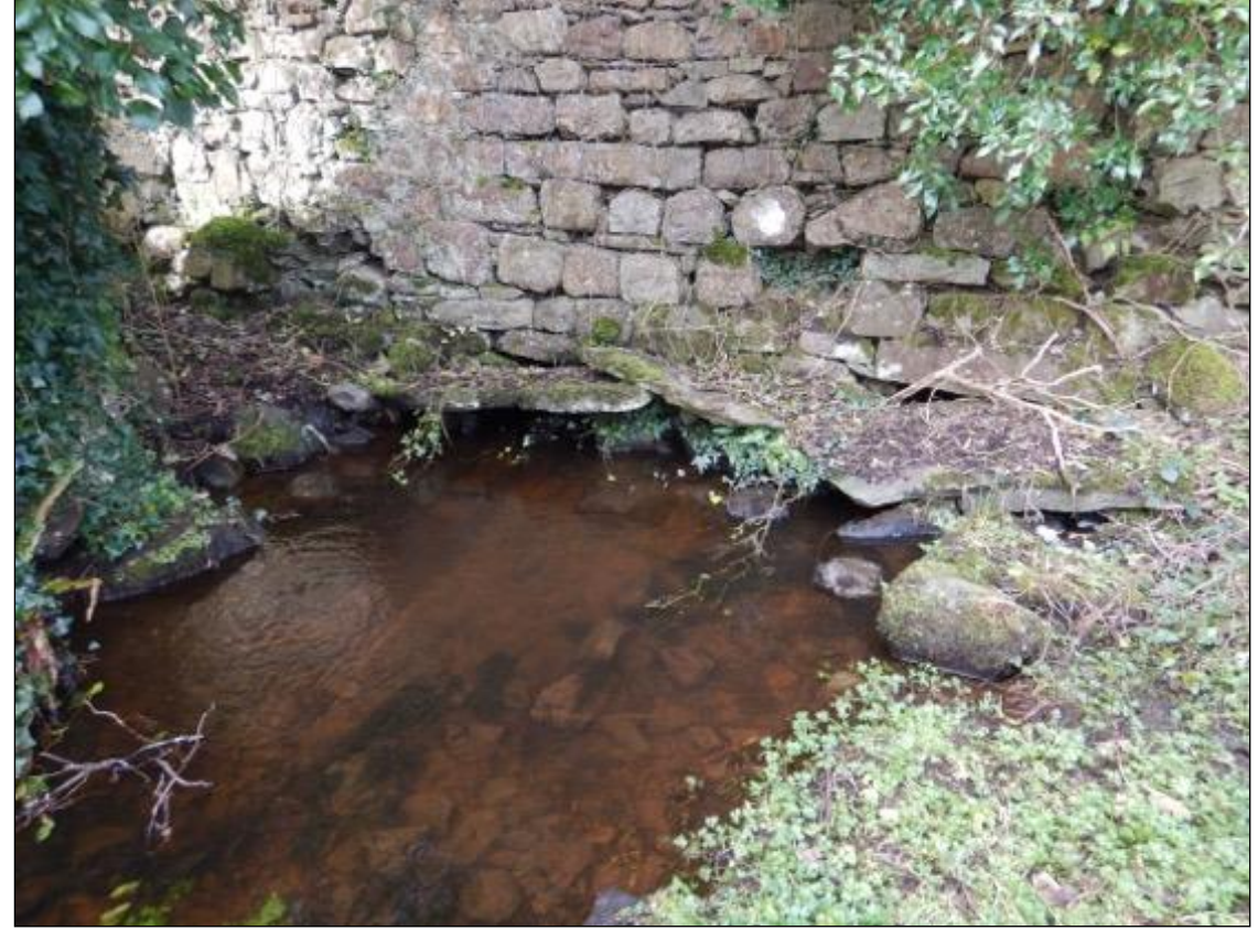
Plate 10.46 Mill race emerging from beneath north end of southern building in north/south range, looking west