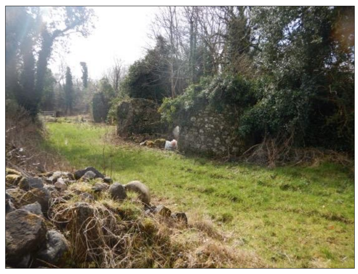
Plate 10.47 Mound of demolition rubble at site of lime kiln shown on 25-inch OS map, looking south towards north/south range of mill complex