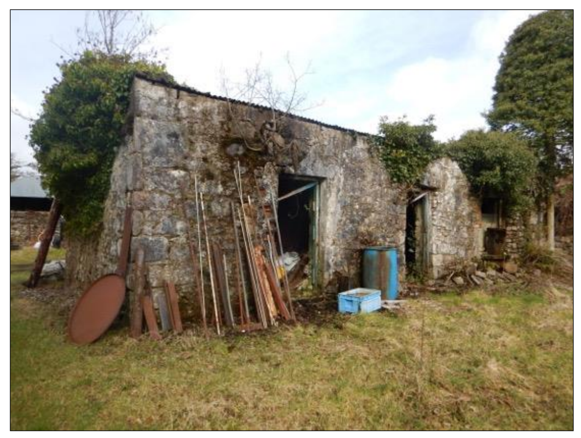
Plate 10.37 Freestanding building at north end of mill complex, looking northeast