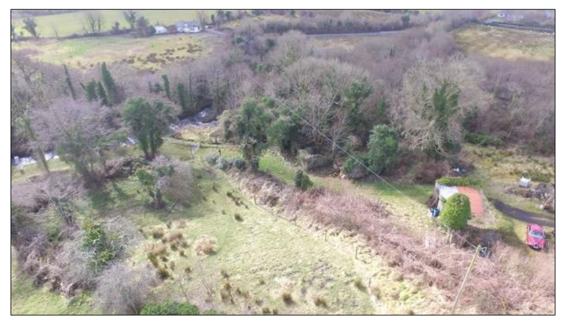
Plate 10.36 Heavily overgrown mill complex at centre, looking southwest