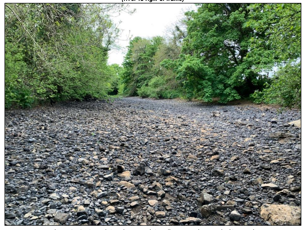
Plate 10.52 View of site of proposed river flow control system looking south