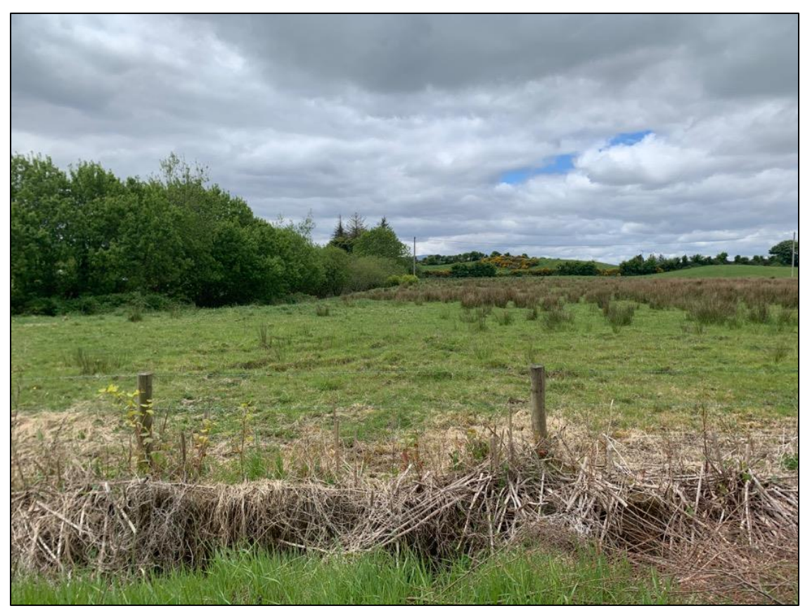
Plate 10.24 South end of field 8. looking west (May 2020)