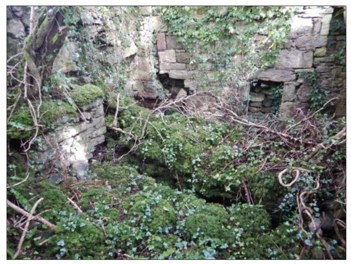
Plate 10.45 Two water filled mill races within northern portion of southern building of north/south range, looking north