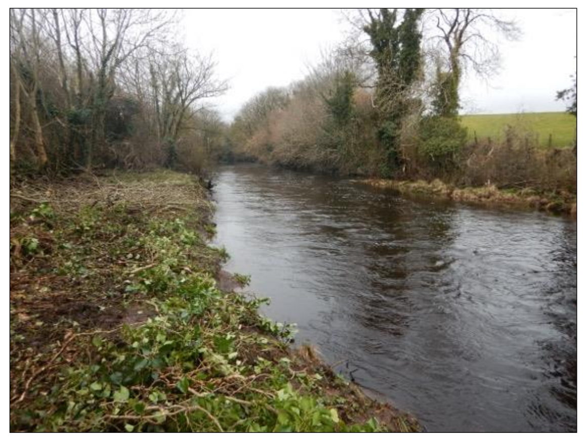
Plate 10.2 River Deel, looking west at west end of proposed scheme