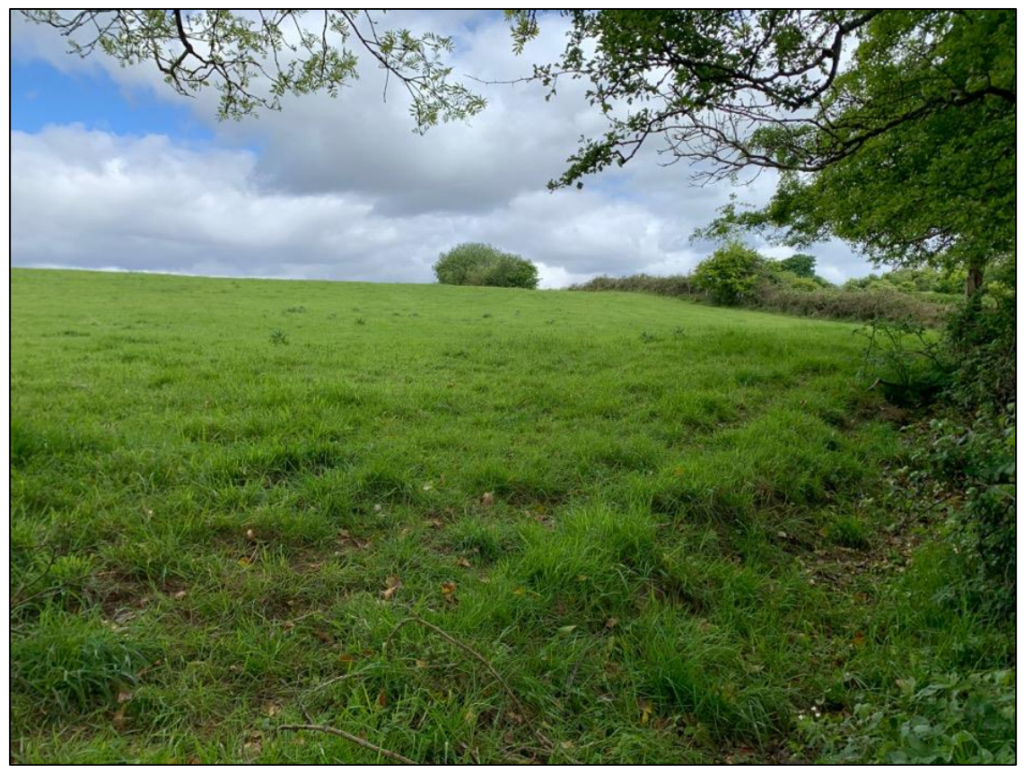
Plate 10.51 Site of proposed access point to the west of the proposed river flow control system, looking north (river to right of frame)