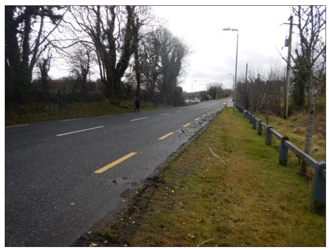
Plate 10.25 Road crossing between fields 8 and 9, looking south