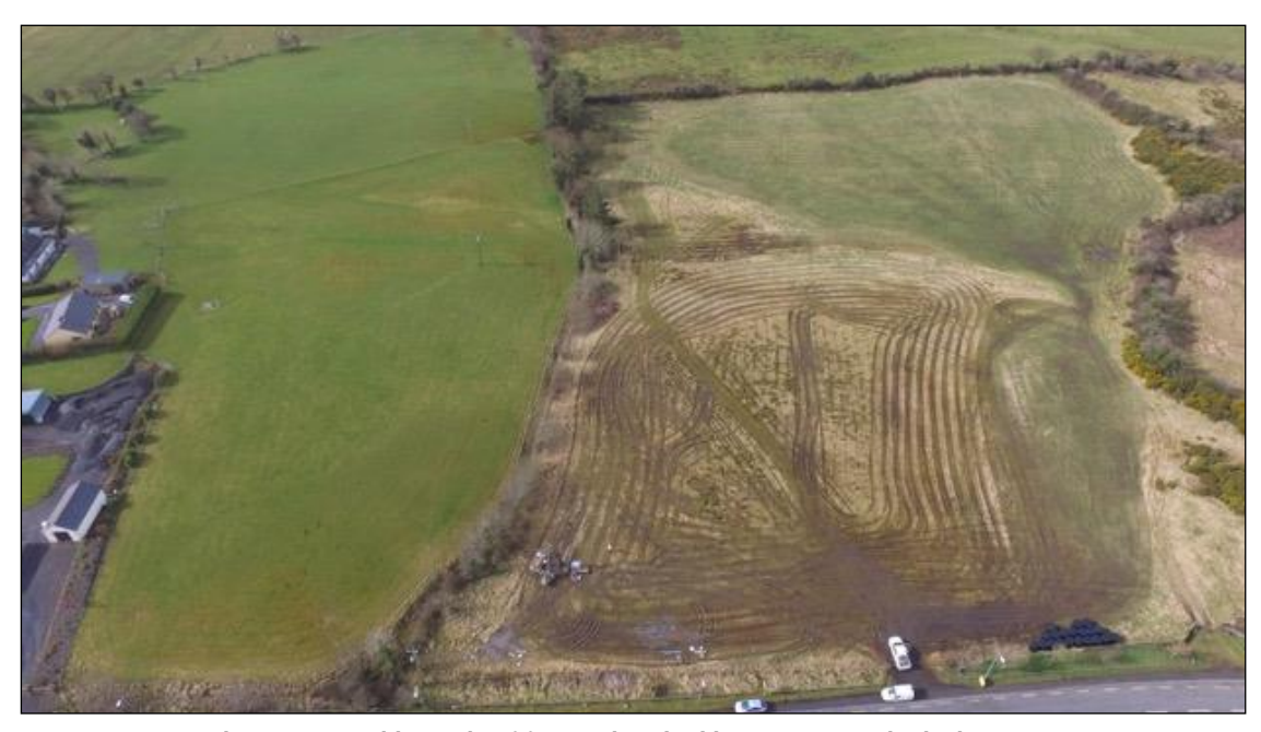
Plate 10.23 Field 8, right of frame, disturbed by ongoing works, looking west