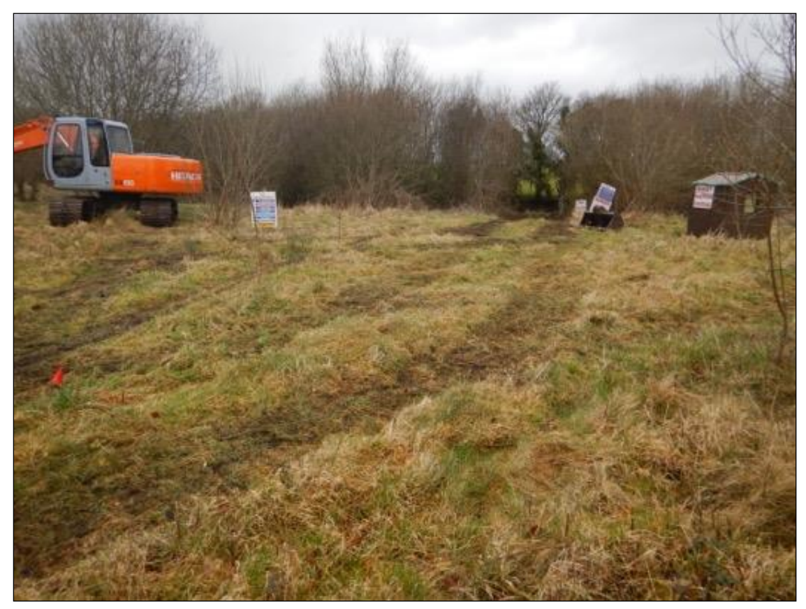
Plate 10.4 Field 1, looking northwest