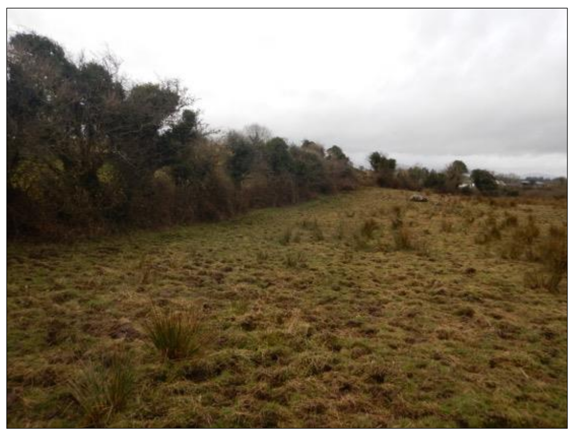
Plate 10.12 Townland boundary within field 4, looking southwest