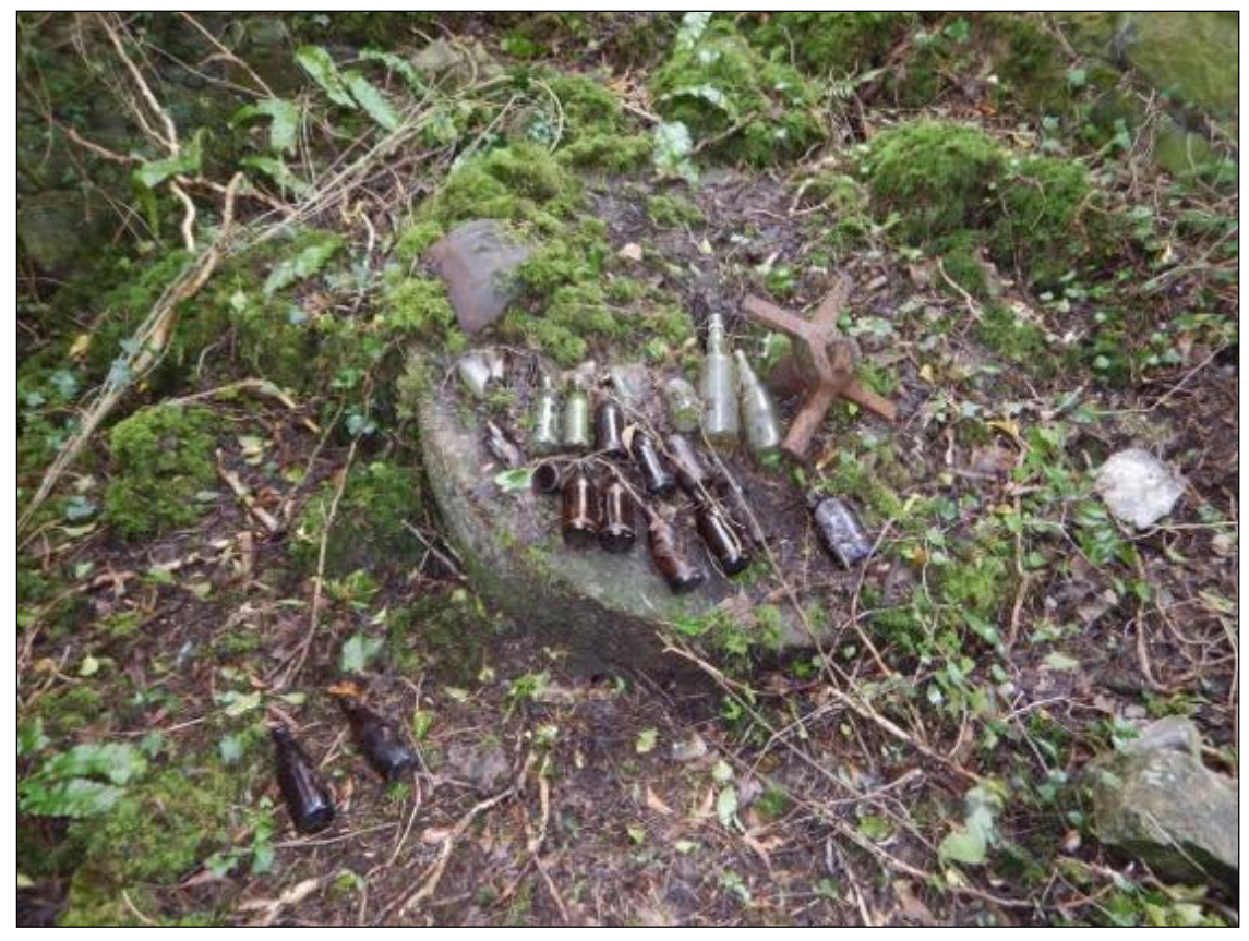
Plate 10.41 Mill stone within central building in north/south range