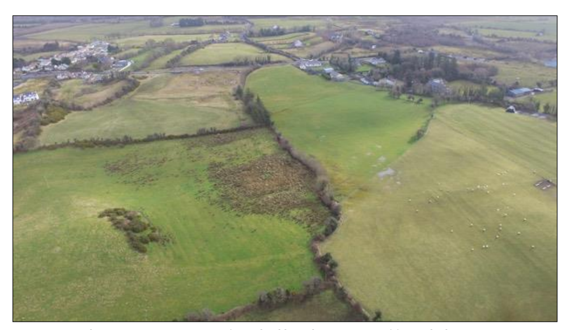
Plate 10.13 Eastern portion of townland boundary at centre of frame, looking east