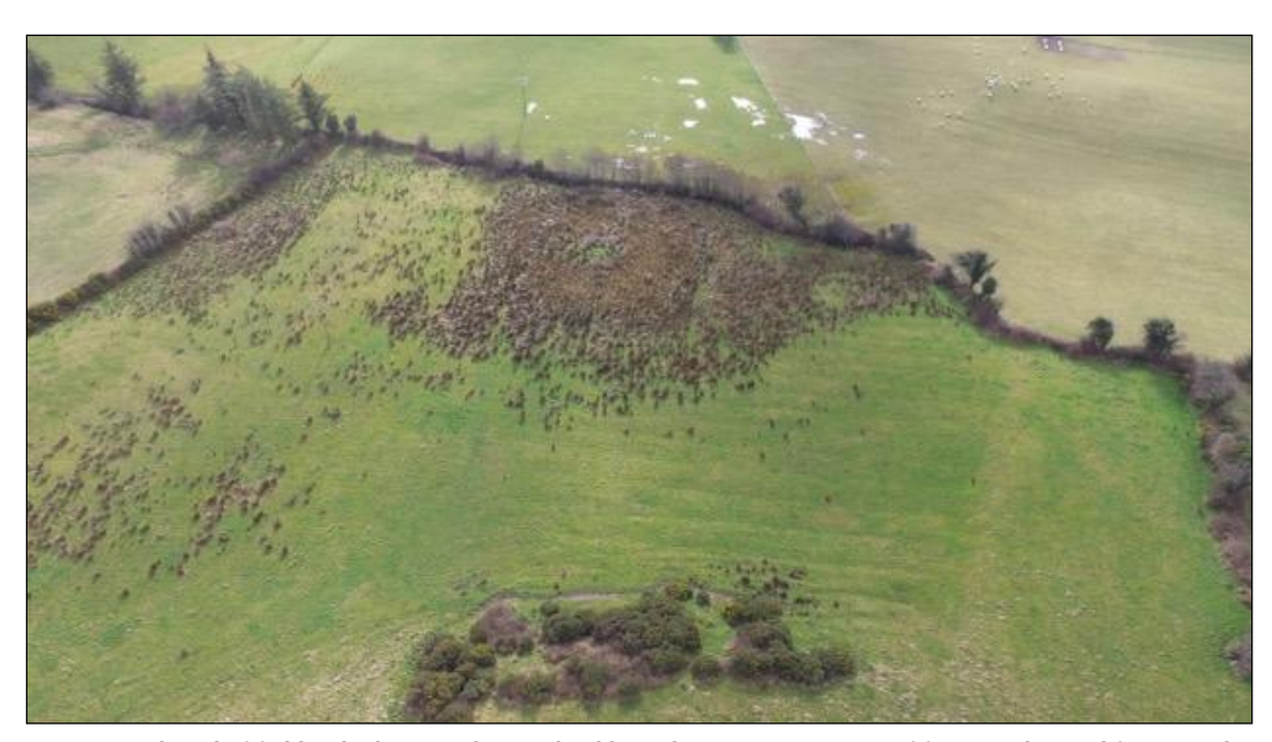
Plate 10.21 South end of field 7, looking south, townland boundary crossing centre of frame, ridge and furrow cultivation evident as crop marks within field