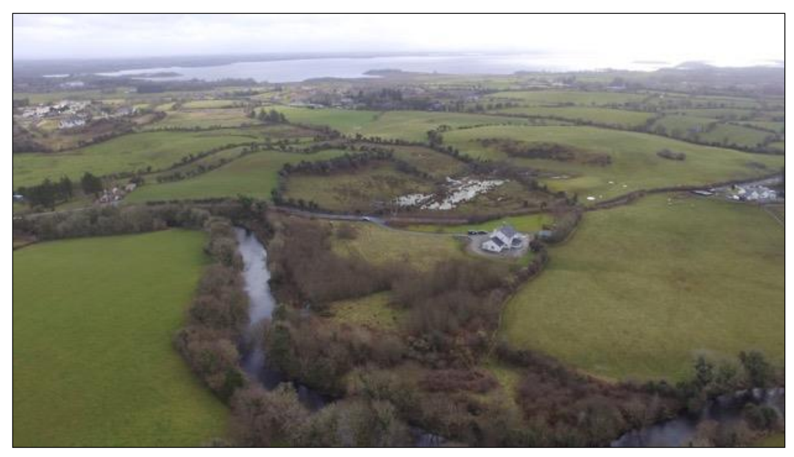
Plate 10.1 Aerial view of proposed works location, looking east