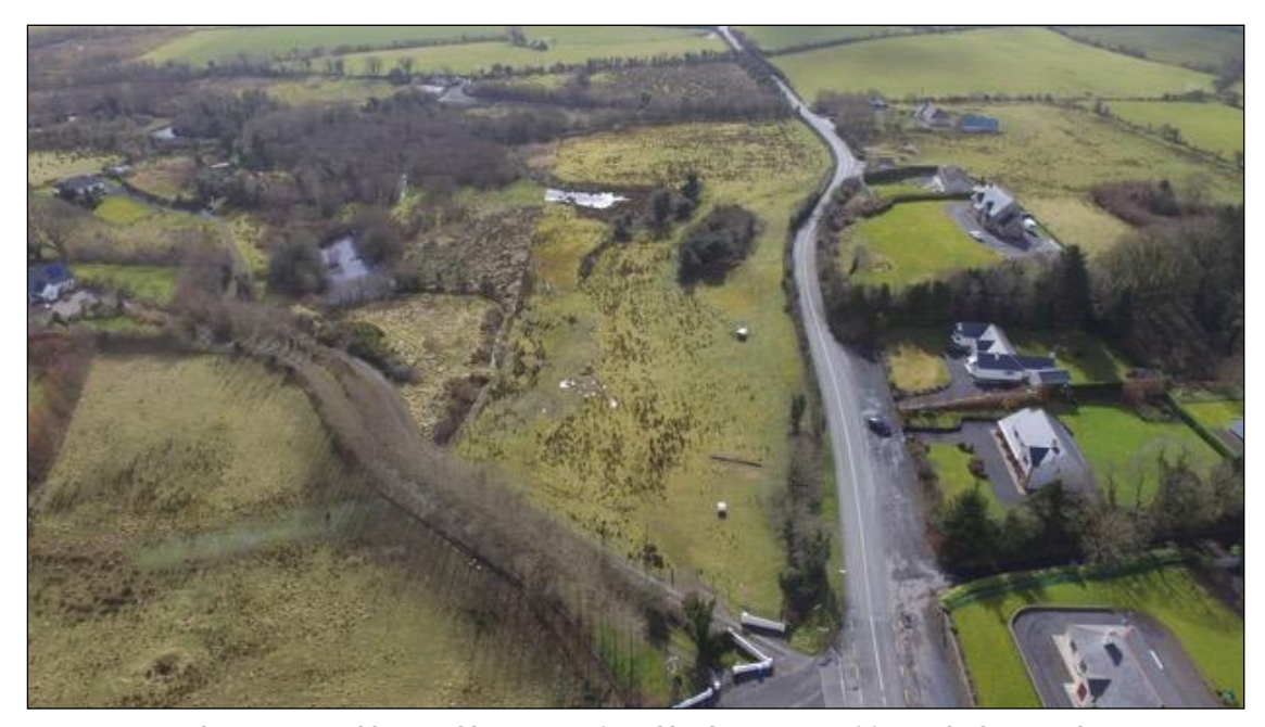
Plate 10.31 Field 11 and beginning of washlands at centre of frame, looking south