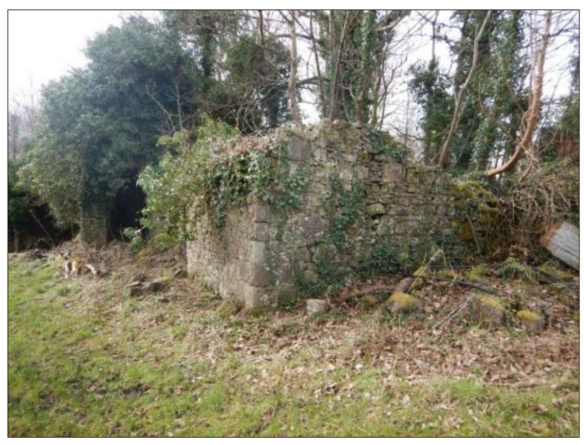
Plate 10.39 Central structure in north/south range of mill complex, looking southwest