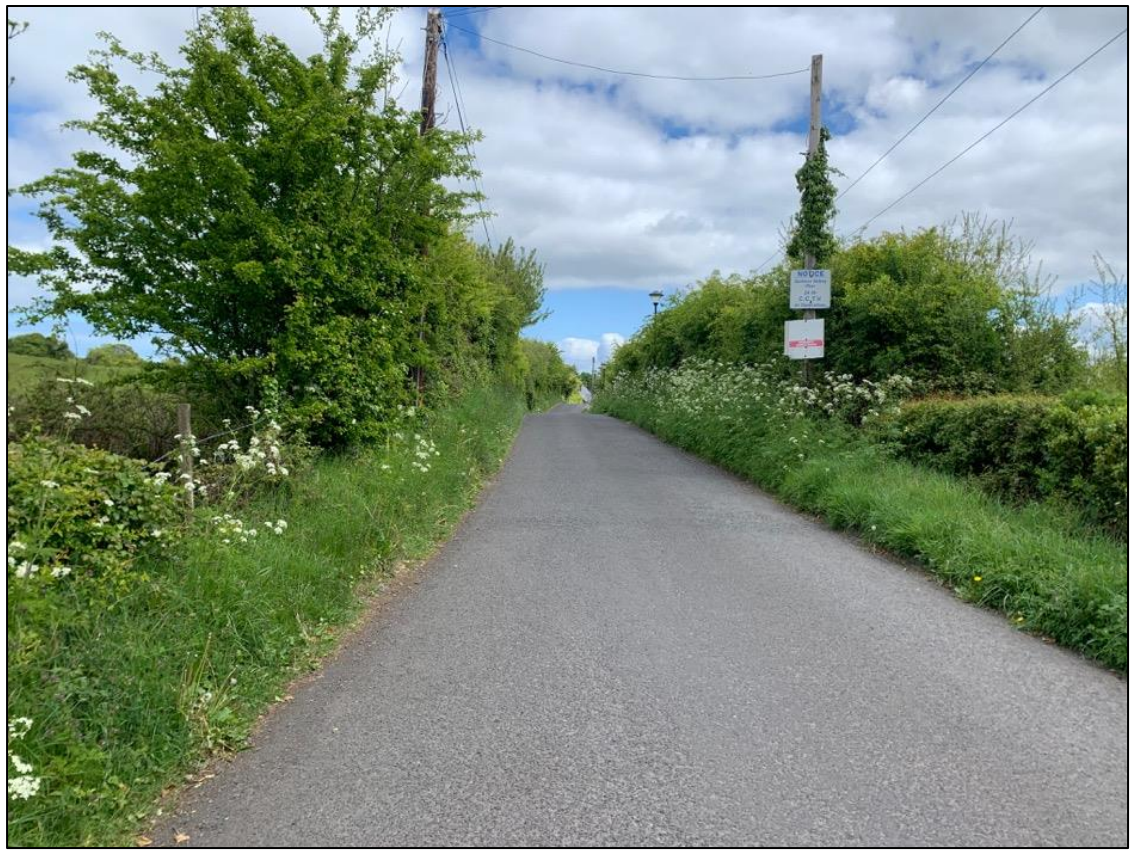
Plate 10.28 Road crossing between fields 9 and 10, looking east (May 2020)