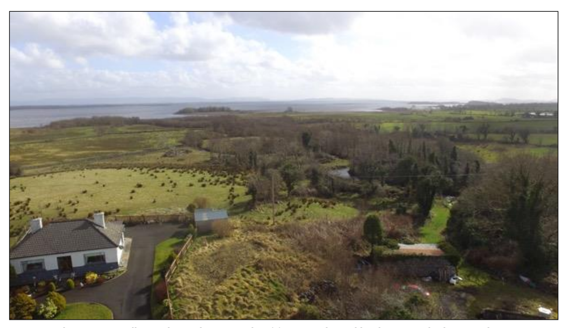
Plate 10.35 Mill complex at bottom right of frame with washlands to east, looking southeast