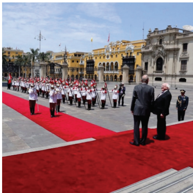
President Michael D. Higgins visits the Presidential Palace in Lima, 2017.

Latin America and the Caribbean has a population of more than 650 million with a significant and growing middle class. The COVID pandemic has hit the region harder than most, but it remains a dynamic, creative global player, with huge differences within and between its many countries, peoples and cultures. The potential for mutual benefit from enhanced two-way engagement – both bilaterally and through the EU – across a whole range of sectors is very significant. The Strategy will make an important contribution to our collective efforts to recover from the severe human and economic costs of the pandemic.