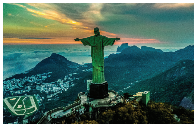
Christ the Redeemer statue lights up in green for St Patrick's Day, Rio de Janeiro, 2021.