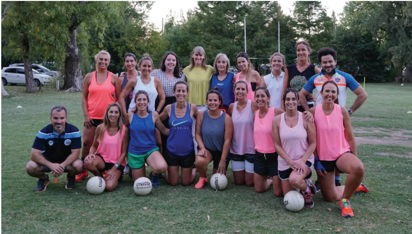
Ladies' Gaelic football team, Buenos Aires, 2020.