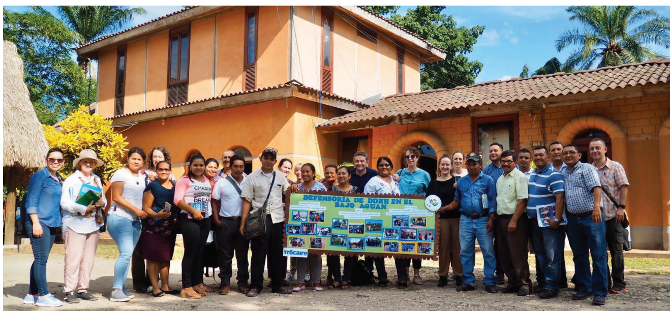
Irish Aid monitoring visit, Honduras, 2019.