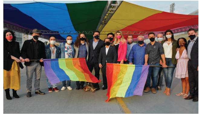
Staff of Embassy Brasilia and Consulate General Sao Paulo celebrate Pride with local activists, Brazil, 2021.