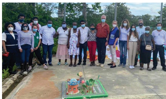
Embassy Bogota participates in a human rights trip to Antioquia, Colombia, 2021.