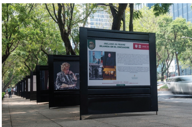
Ireland in Frame street photography exhibition, Mexico City, 2021.