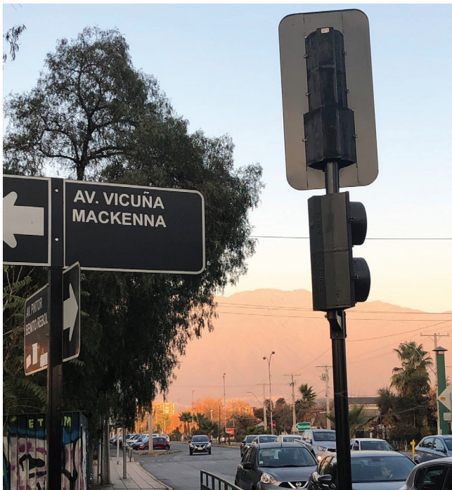
Avenue MacKenna, named after Chilean writer Vicuña MacKenna, grandson of Irish-born Chilean independence hero Juan MacKenna, Santiago, Chile, 2021.