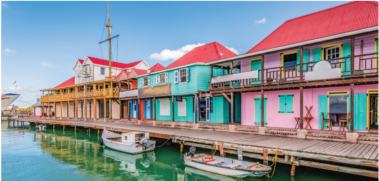
St. John's, capital of Antigua and Barbuda. Enhanced engagement with the Caribbean states is a key element of the Strategy.