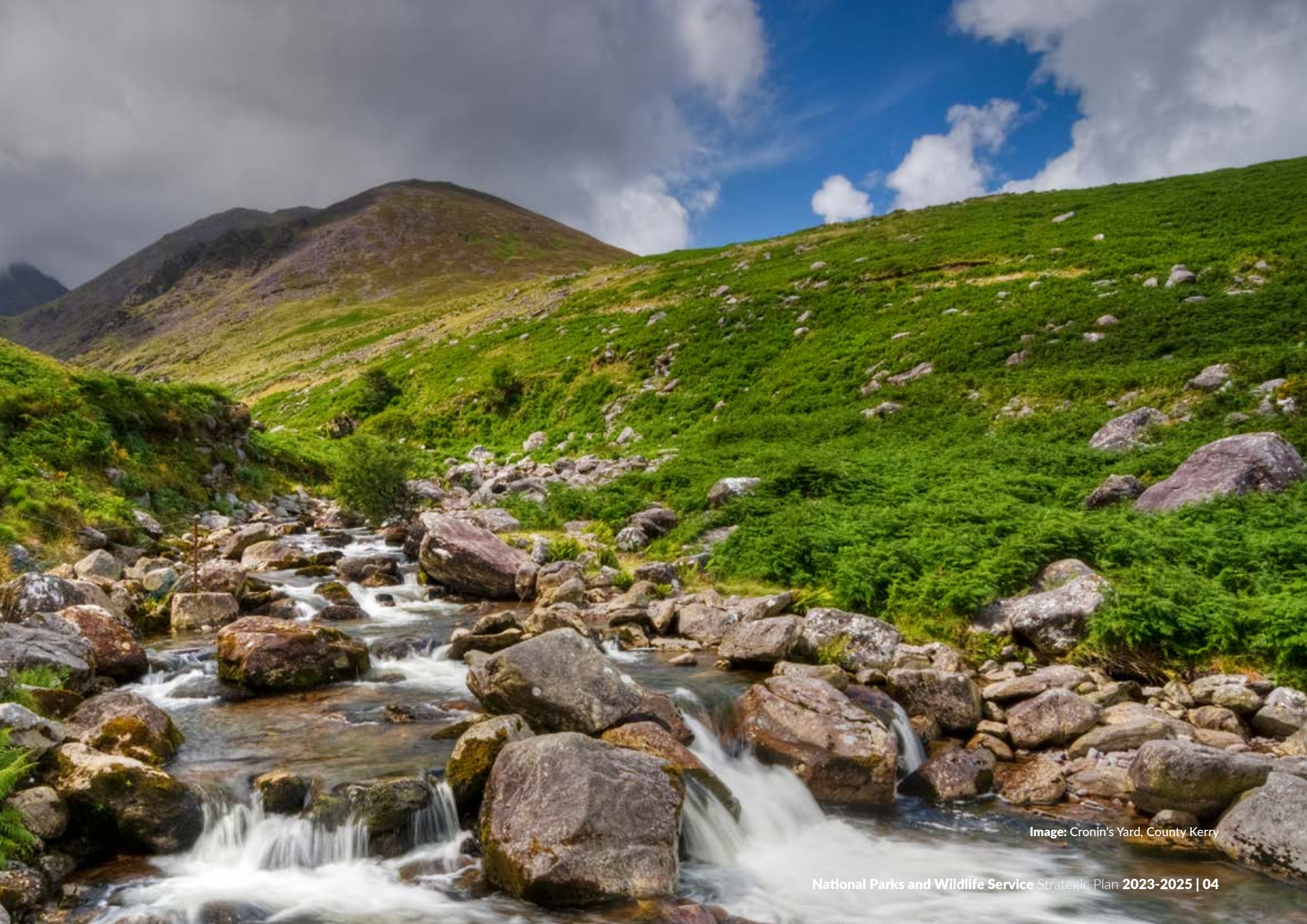
Image: Cronin's Yard, County Kerry