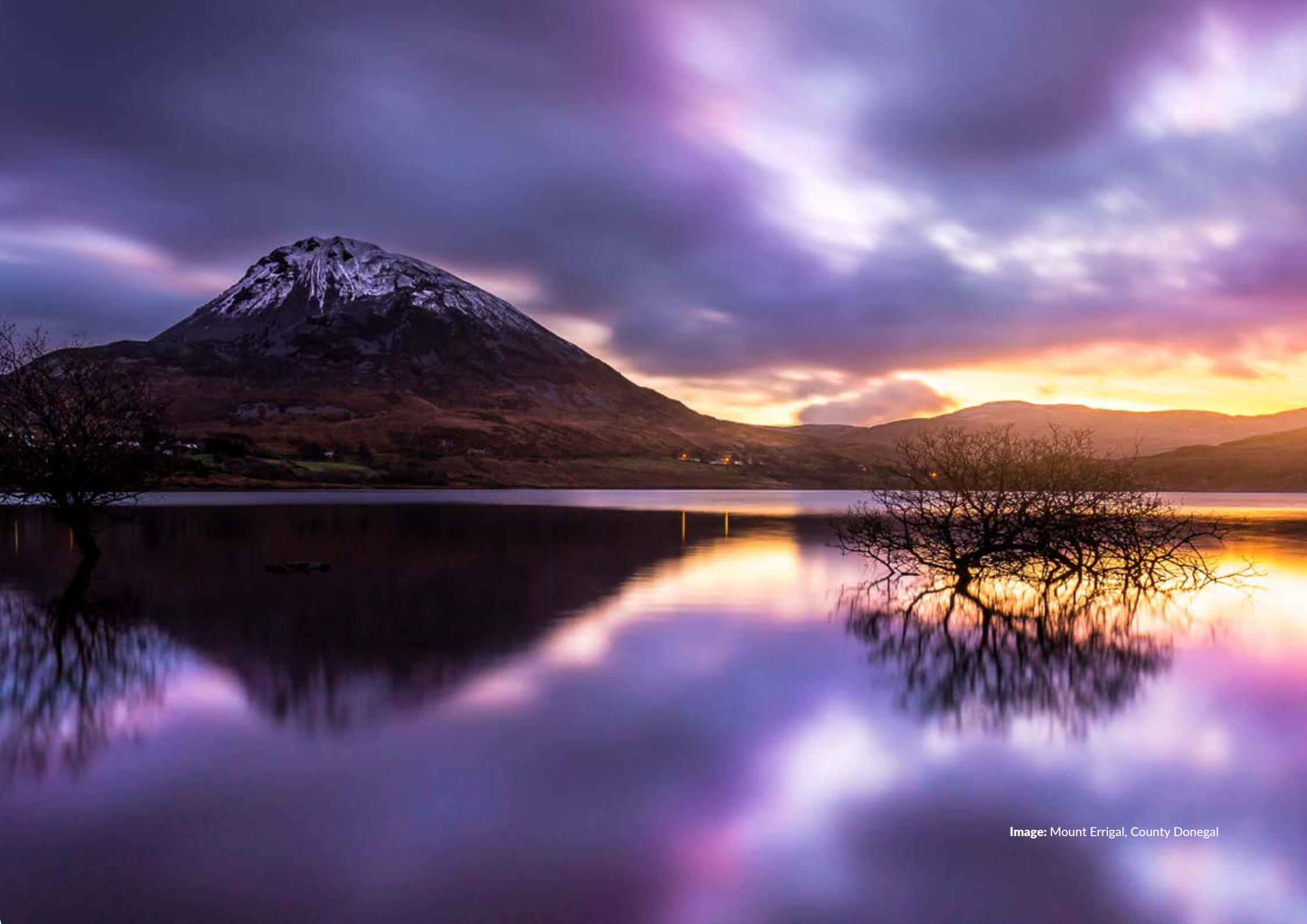
Image: Mount Errigal, County Donegal