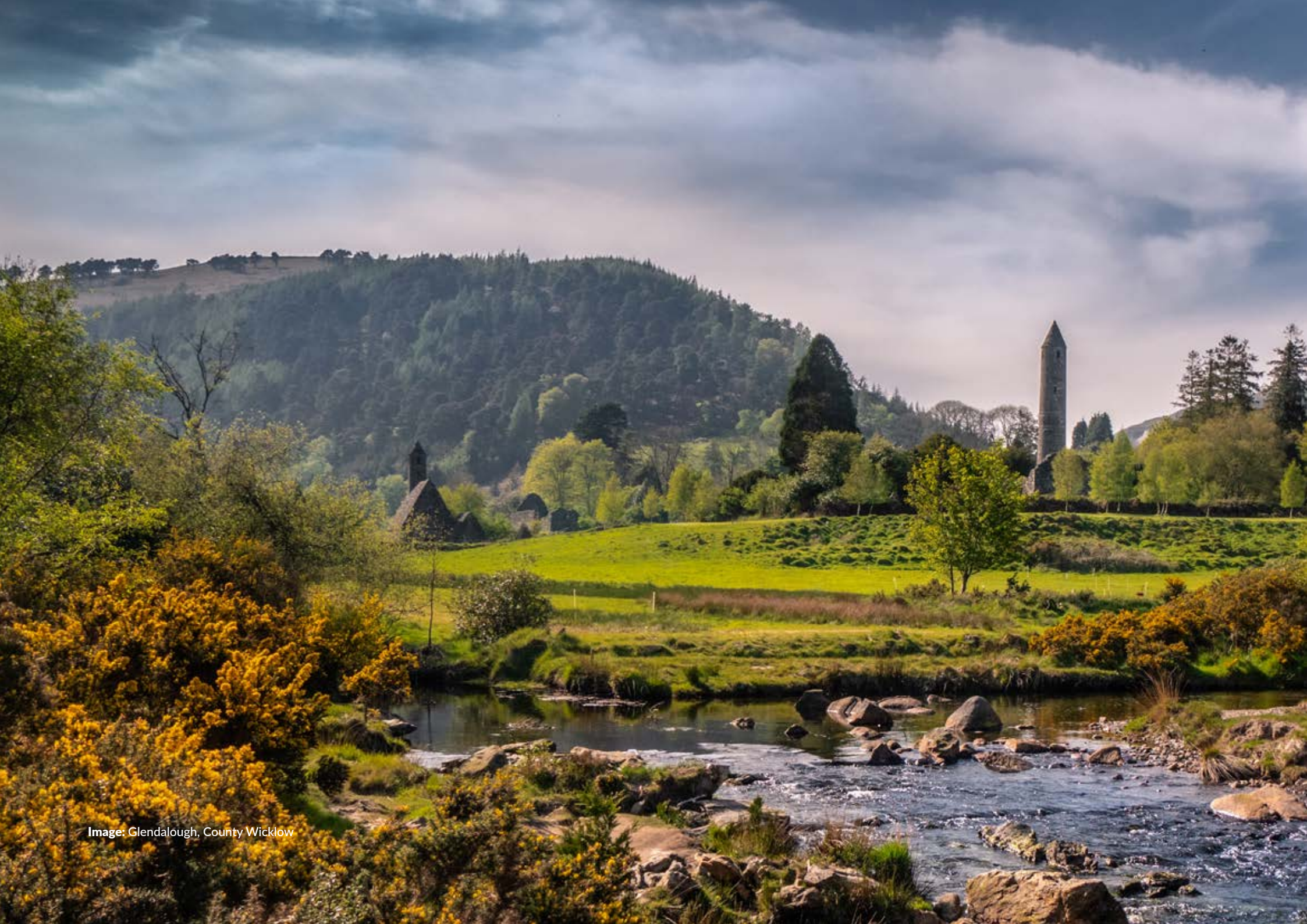
Image: Glendalough, County Wicklow