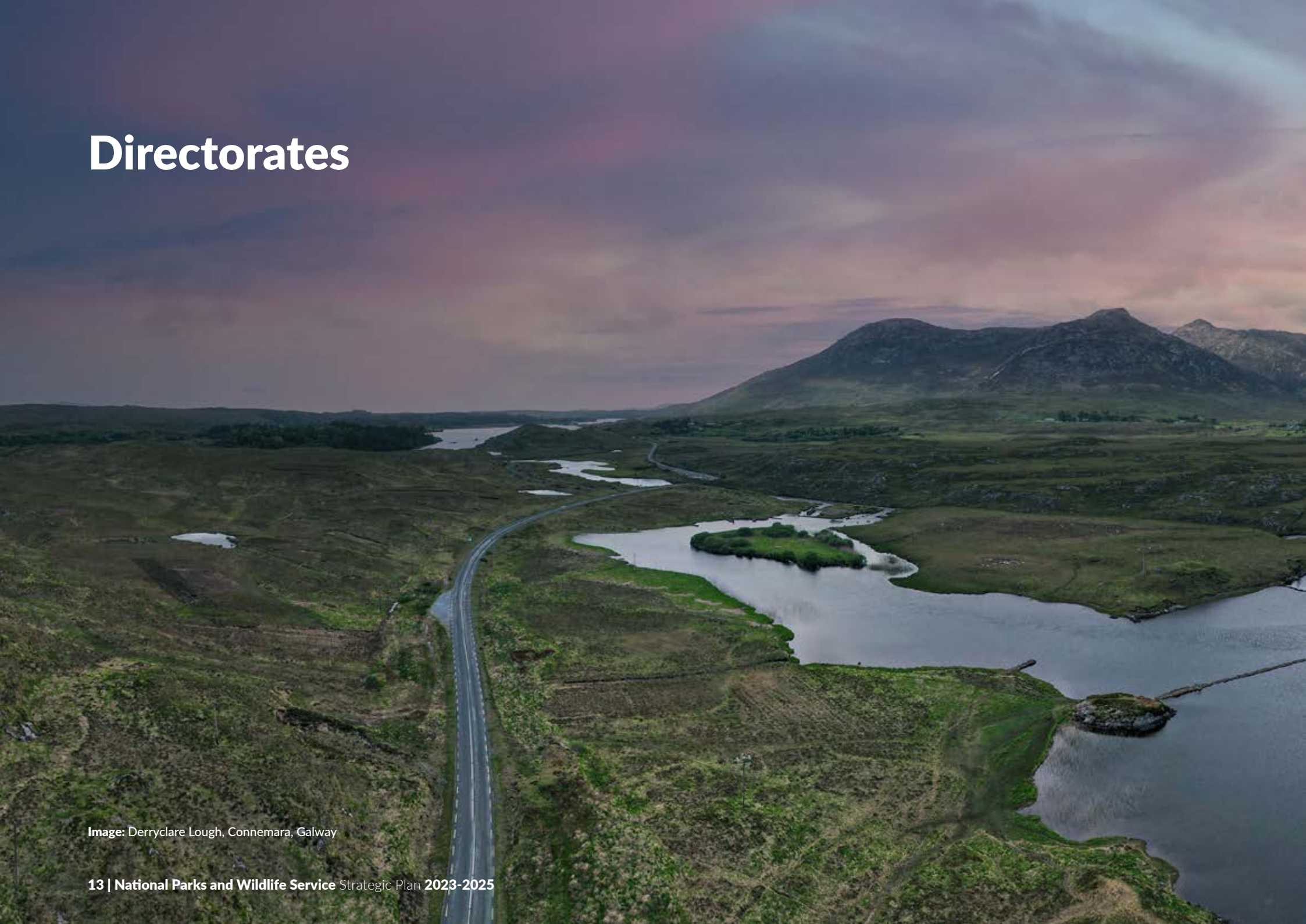
Image: Derryclare Lough, Connemara, Galway