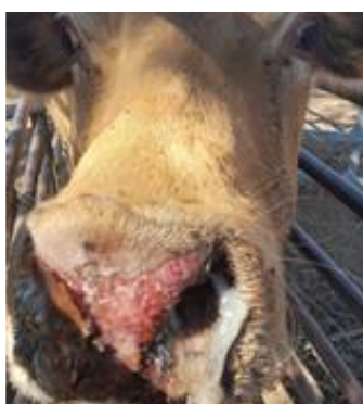
Fig.1 nasal discharge with crusting and redness of muzzle