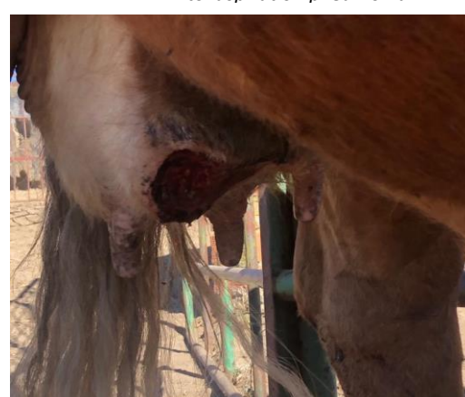
Fig.5 Ulceration and sloughing of skin caused by damage to blood vessels in the skin