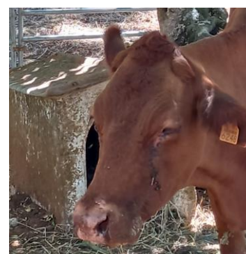
Fig.3 EHD can cause dullness and depression, with high temperatures, discharge from the eyes and nose. Damage and swelling of the tongue and the muscles in the neck can lead to aspiration pneumonia