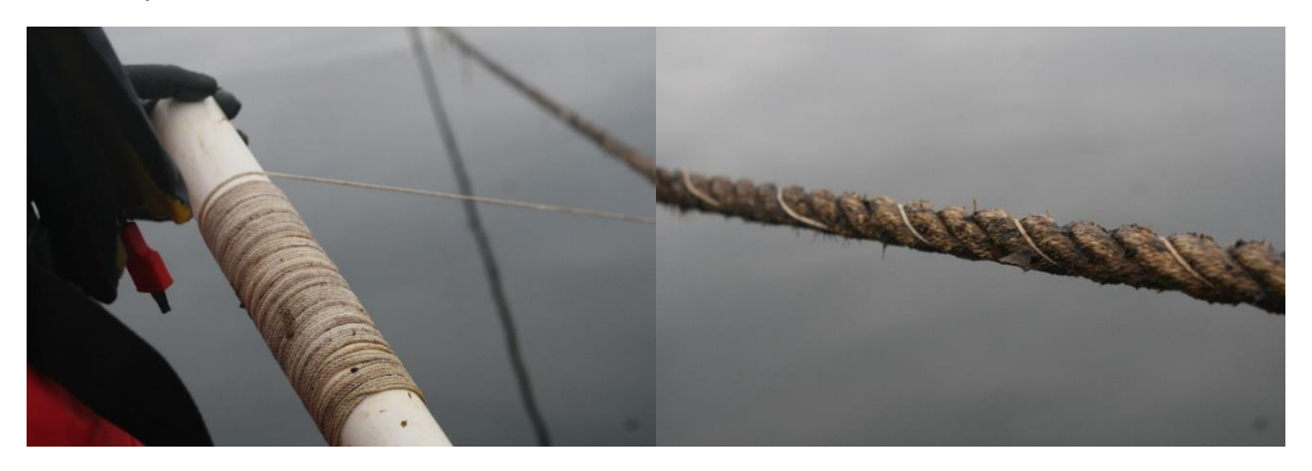
Seaweed string from Irish hatchery being deployed onto longline head-rope

There are currently two seaweed aquaculture licenced sites for the cultivation of various species of seaweed using semi-submerged longlines at two sites in Blacksod Bay (T10–296A, T10-320A). One of these producers has applied for a new licence in order to expand an existing site (T10-296A) in the same area of Blacksod Bay. There are an additional 3 new applications for seaweed longline cultivation (T10-351A, 352A, 355A), 2 of which (T10-351A and T10-352A) have also applied to include other shellfish species (mussels, pacific and native oysters, and scallops) using longlines and hanging cultivation systems.