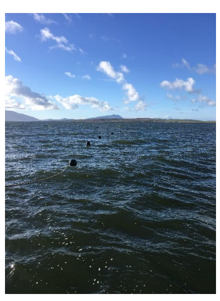
Seaweed single longline with grey and black buoys in Blacksod Bay.

The single seaweed longlines are suspended at ~1 metre depth using grey and black floats. Currently it takes six days over the months October — November to deploy the seeded string onto the 25 longlines on the existing 2 licensed sites which vary 150 to 220 metres in length. The sites are visited and checked once or twice per month until the following spring when harvesting begins. At the moment it takes a maximum of six days to harvest the seaweed crop over the months April to May, and possibly to the end of June with sugar kelp. It is envisaged that the number of days for harvesting will decrease to three days in the coming year when a new specialised barge will be brought in by one of the producers. Once seaweed is brought ashore it is sent to a specialised drying facility where seaweed is dried and processed for various markets.