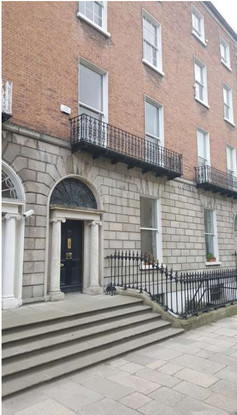
The Housing Agency

The Housing Agency is a state body under the aegis of Department of Housing, Planning and Local Government.